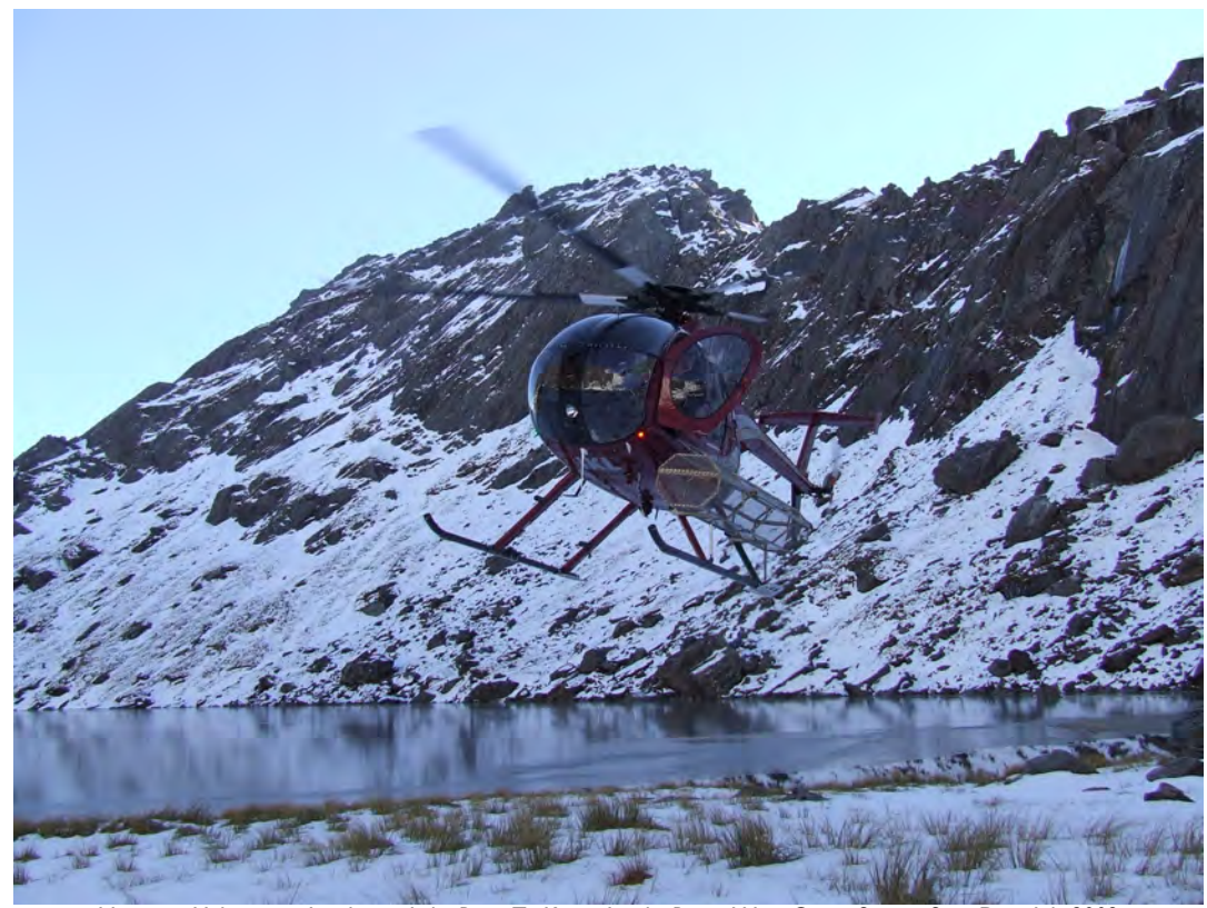
Mountain Helicopters Landing at Lake Roto Te Koeti, Jacobs River, West Coast. Source Sean Dent July 2009

The rules for aviation activities in the Rural Zone deal with all potential informal airports including setting a Permitted Activity threshold to allow for temporary or infrequent use of airports being five excursions (landing and take-off) per week from a property.