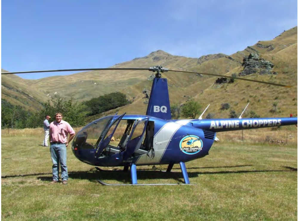
Alpine Choppers R44 Contracted by Civic Corp and Landed Near Ben Lomond Station January 2006.

A copy of the relevant provisions from each Districts plan is also appended to this report as Appendix [B] .