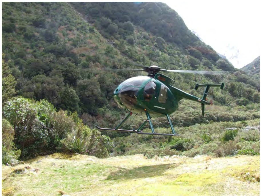
Mountain Helicopters Landing in the Butler River, West Coast 2007

Subsequently, any future changes to the existing District Plan provisions regarding informal airports in the Rural General Zone and on Crown Pastoral Land would need to account for this difference in assessment.