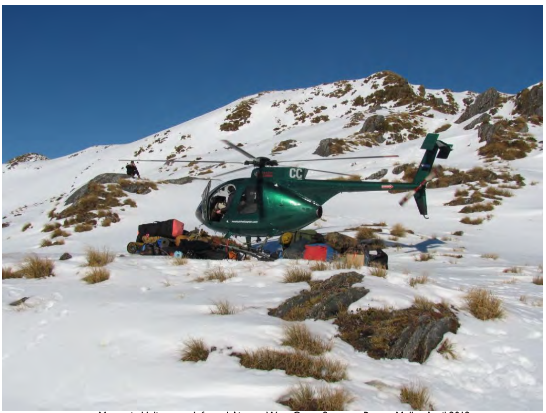
Mountain Helicopters Informal Airport West Coast. Source – Rowan Muller April 2012

In regards to temporary or "one off" aircraft landings the Council also has no specific rules or other provisions to control these types of landings.