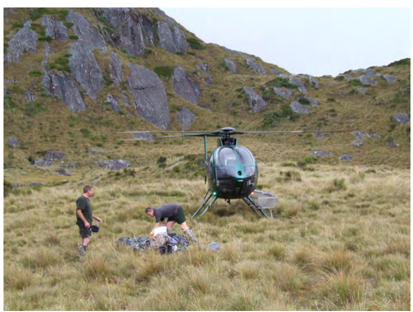
Mountain Helicopters Greer Stream Jacobs River. Source – Sean Dent March 2008

However, as identified in Section 4.1 above, the Departments assessment of effects is restricted to only the effects on the Public Conservation Land which it administers. The assessment and decisions cannot legally include methods for the mitigation of effects on parties outside of the Public Conservation Land in question.