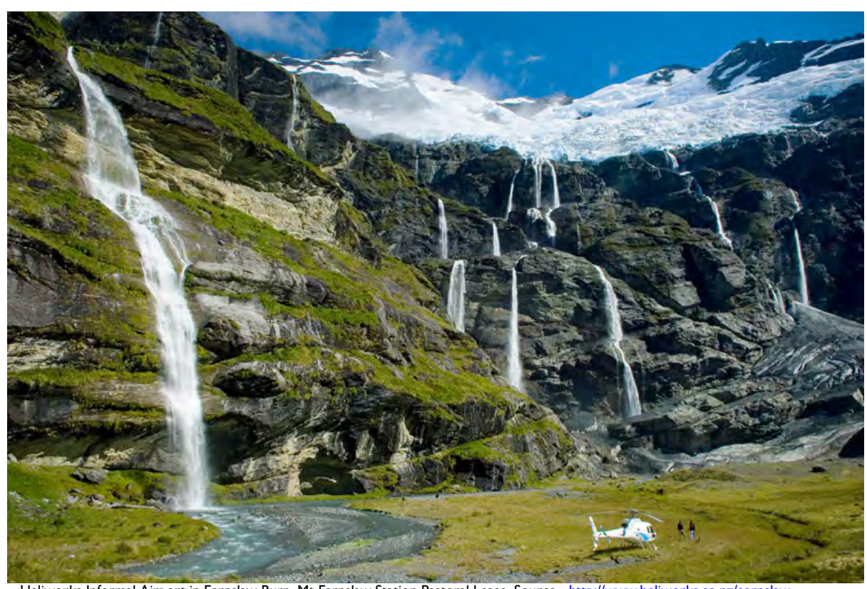
Heliworks Informal Airport in Earnslaw Burn, Mt Earnslaw Station Pastoral Lease.