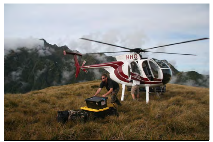
Hunters Departing an Informal Airport.

From an aircraft operator's perspective, this unnecessarily increases costs to their business as well as adding an additional on-going compliance monitoring requirement i.e. annual activity returns for each airport, for each statutory body, and at different times of the year.