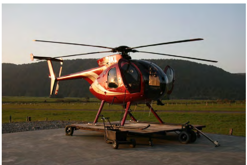
Mountain Helicopters Base, Fox Glacier. Source – Rowan Muller 03 April 2012

Additionally, while Rule 6.5(d) refers specifically to helipads it also refers to "similar types of leisure activities". Leisure activities are not defined in the WDP either however, discussions with Mr Simpson have confirmed that this rule would also encapture informal airports or airstrips for fixed wing aircraft.