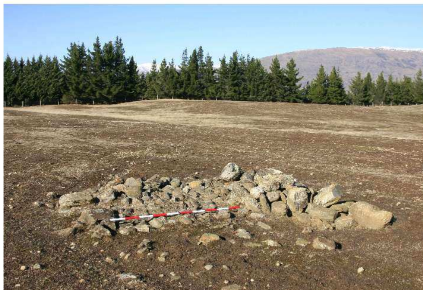
_MG_4275 View SE over possible rock shelter site (3x3 m2) with shallow channel across northern left side of image Kopuwai Consulting