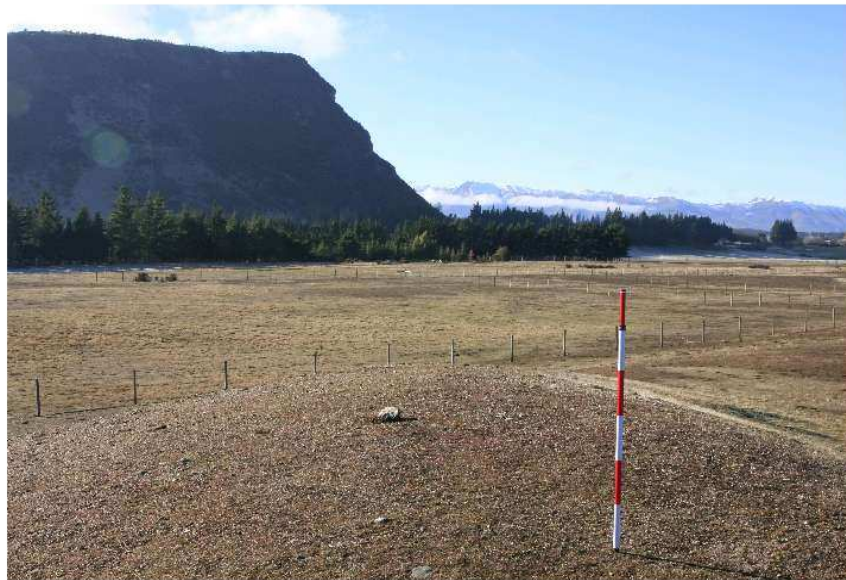
_MG_4267 View north east from high knob across to old runway Kopuwai Consulting