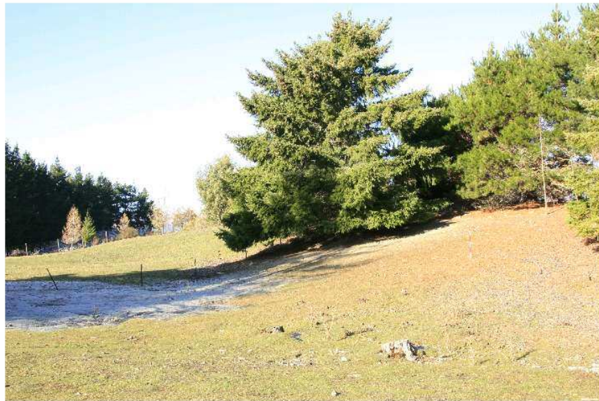
_MG_4255 terrace face running boundary with old runway. No evidence of water races observed Kopuwait Consulting