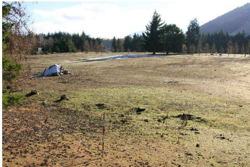
_MG_4257 View north of terrace into Robertson property Kopuwait Consulting