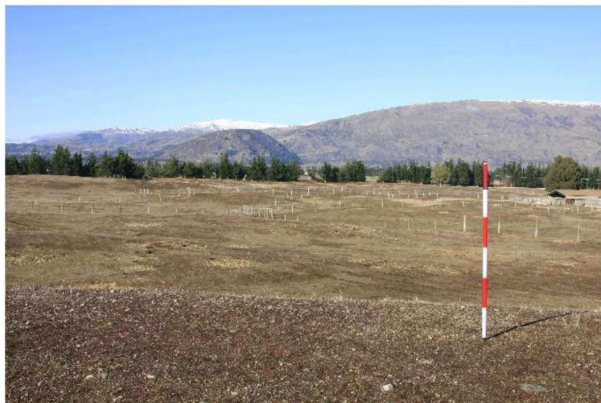
_MG_4266 View east from high knob across to pine boundary. Kopuwait Consulting