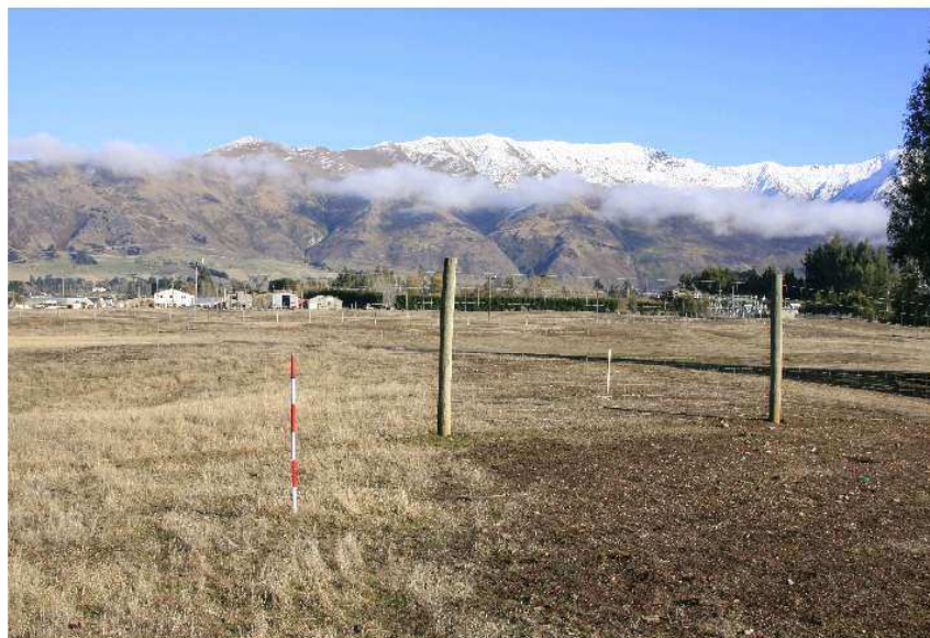
_MG_4270 SE Boundary point with view across to power transmission yard Kopuwai Consulting