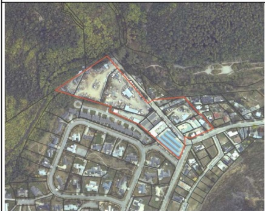
Aerial photo of subject site showing area of the submitter's re-zoning request outlined in red.