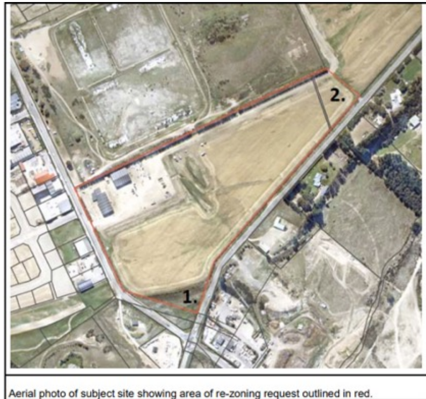
Aerial photo of subject site showing area of re-zoning request outlined in red.