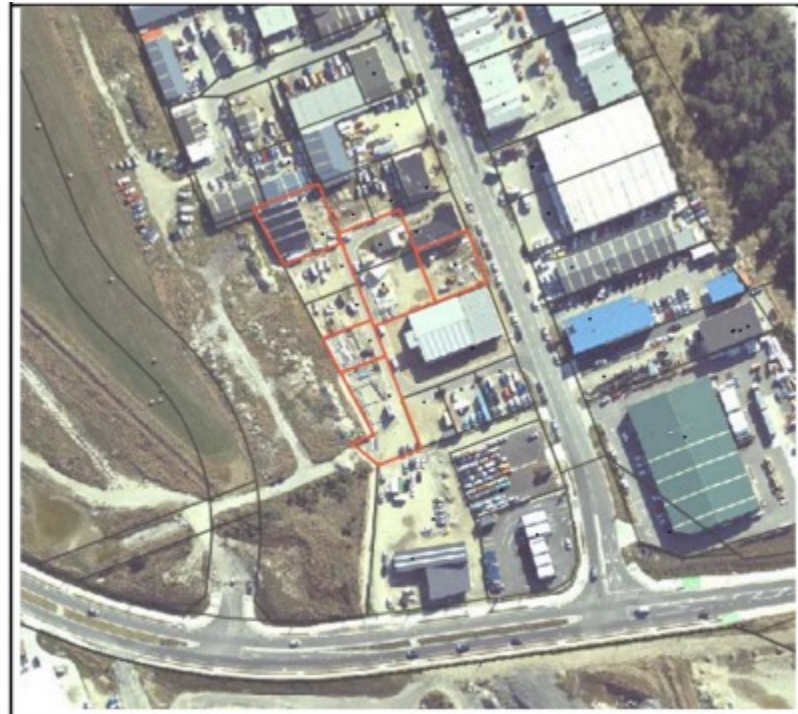
Aerial photo of subject site showing area of re-zoning request of M Space Partnership Ltd outlined in red.

228. The submitter called no expert evidence and did not appear at the hearing.