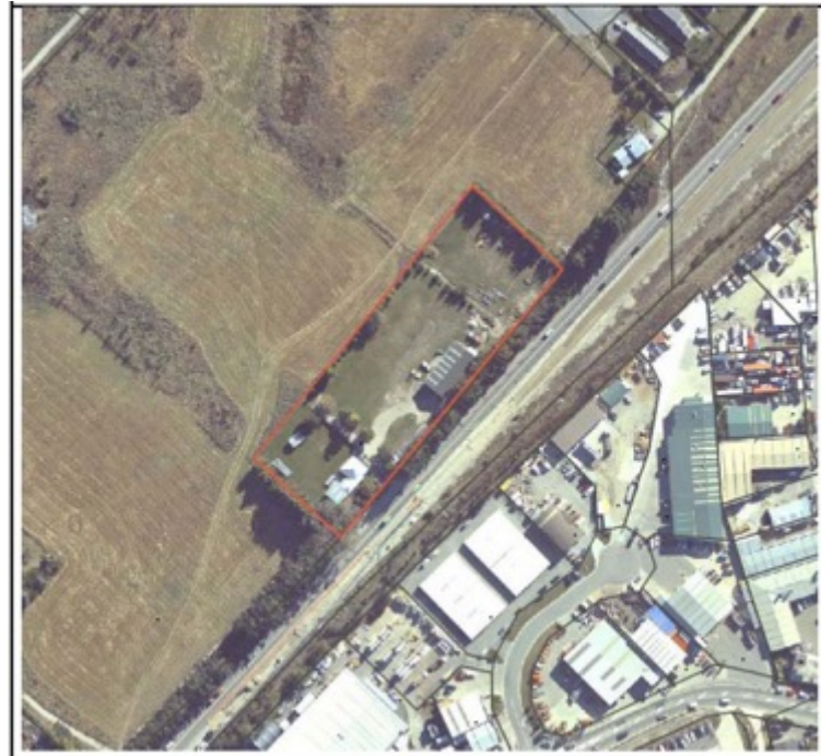
Aerial photo of subject site showing area of re-zoning request outlined in red.

241. One effect of the PDP zone framework is that for travellers on the Highway, the base of the Queenstown Hill would come to be characterised by smaller-scaled, and higher-quality residential developments. Larger buildings in either of the BMUZ or the Local Shopping Centre zone would, because of the consent requirements that apply to new buildings in each, also have to demonstrate a suitable design quality was being achieved including in relation to the Highway frontage. We find that this is an appropriate means of responding to the landscape and landform feature that is Queenstown Hill. Visually prominent GISZ development, which could occur as a permitted activity and which is in general expected to exhibit lower visual amenity values than the other urban zones, is in our view likely to be anomalous and not acceptable.