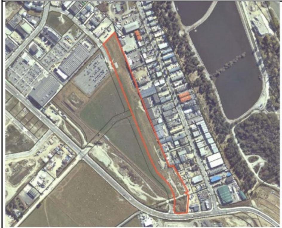
Aerial photo of subject site showing area of the QAC re-zoning request outlined in red.

221. In terms of the Frankton Flats B zone, this would bring the affected part of the Site into line with the zone that applies to the majority of the submitter's site. This is a zone that Mr. Place highlights as not to date having been carried into the PDP. Amongst other things, this also means that its objectives, policies and methods have not been considered in light of the PDP strategic framework and we have no evidence to demonstrate that it as a package is sufficiently compatible with that framework that it can be so simply carried across. For that reason, we do not agree that it has been proven to be a satisfactory alternative for us to consider.