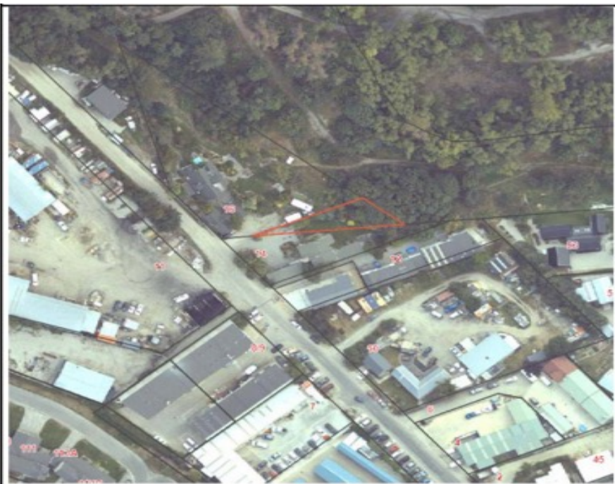
Aerial photo of subject site showing area of the M Thomas re-zoning request outlined in red.