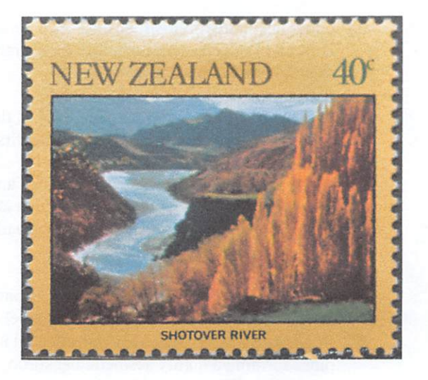
Figure 6 - NZ Post 1981 Scenery Series Shotover River 40c Stamp

45. In 1981 New Zealand Post produced a NZ Scenery Series of Stamps showing the same view of the Shotover River from the same vantage point. See Figure 6.