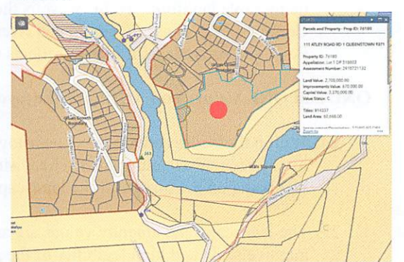
Figure 3 – Screenshot from QLDC PDP GIS Map. Taken 3/4/22. Red dot added to show the location of land subject to C150/2019 decision