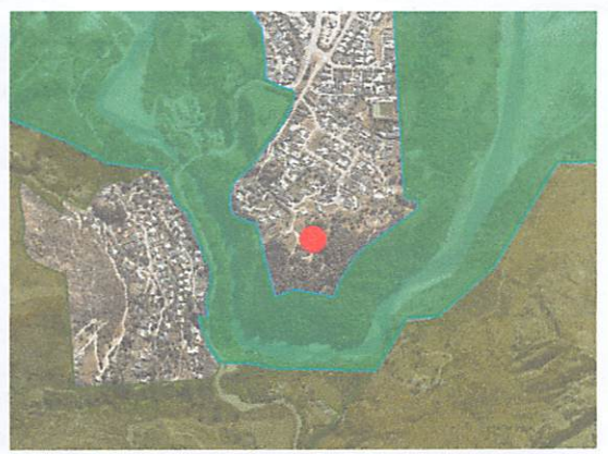
Figure 2 - Screenshot from QLDC Landscape Schedules GIS Map. Taken 3/4/22. Red dot added to show the location of land subject to C150/2019 decision

17. The position of the boundaries to these priority areas forms a tight confluence in Arthurs Point which has created an unreasonably high degree of complexity, and maximised confusion for submitters who have struggled to correctly identify exactly where all these priority landscapes are located and what they should submit for each.