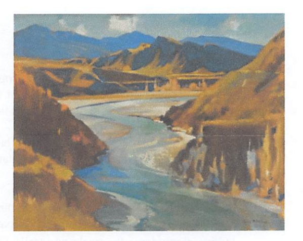
Figure 5 - Shotover River by Peter McIntyre