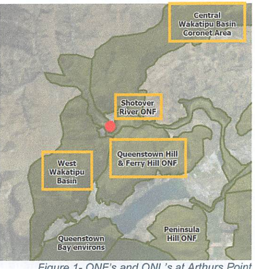
Figure 1- ONF's and ONL's at Arthurs Point

of the Shotover River ONF, the Queenstown & Ferry Hill ONF and wider ONL's surrounding Arthurs Point are appropriately protected from inappropriate subdivision development.