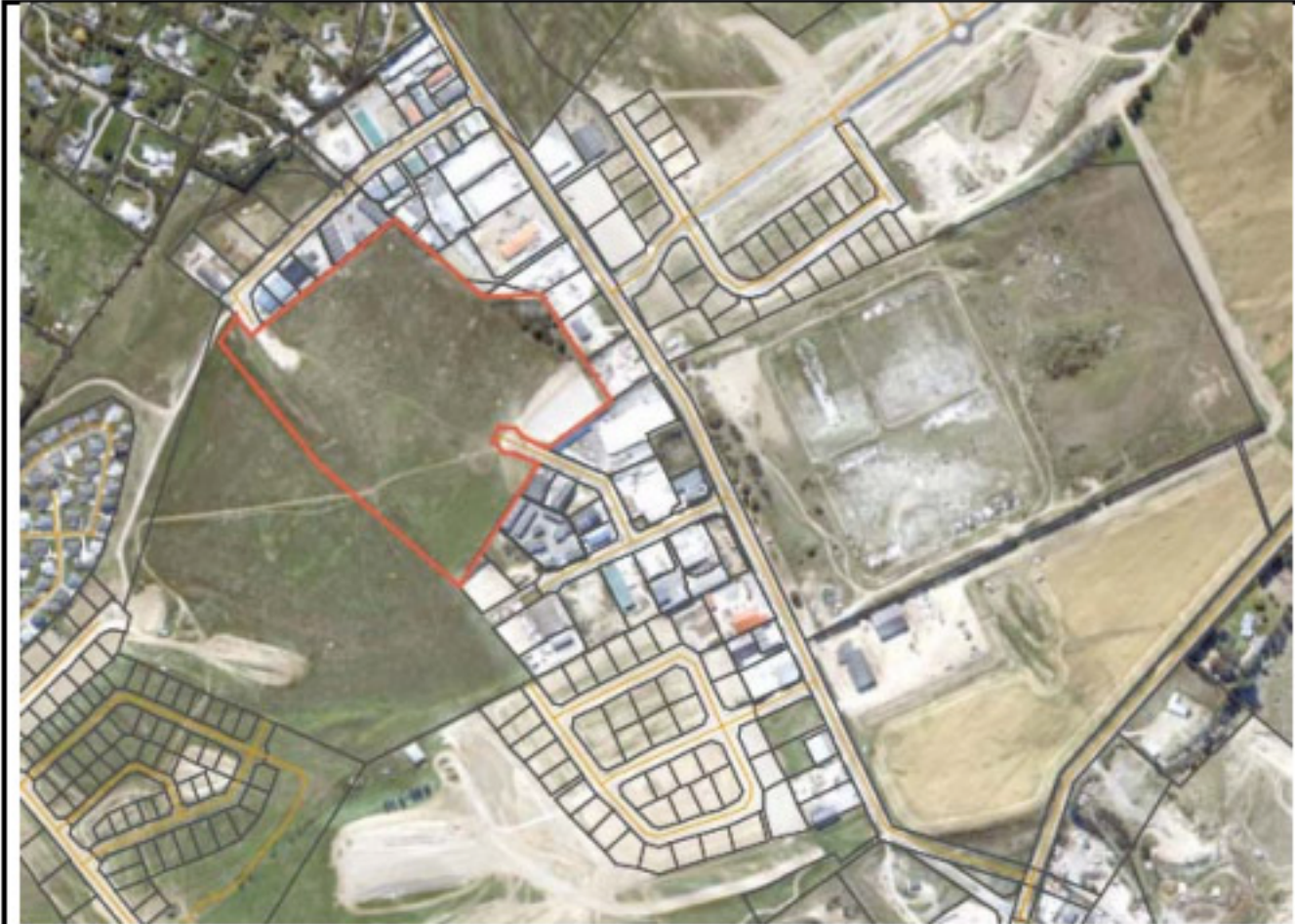
The Tussock Rise Limited land at Lot 2 DP 477622 shown outlined in red.

168. A number of submissions were received requesting a revised zoning framework in the GIZ area in Wānaka. These rezoning requests broadly seek the same relief as that set out by Tussock Rise Limited (Tussock Rise). Given this we have considered these submissions as a group and refer to