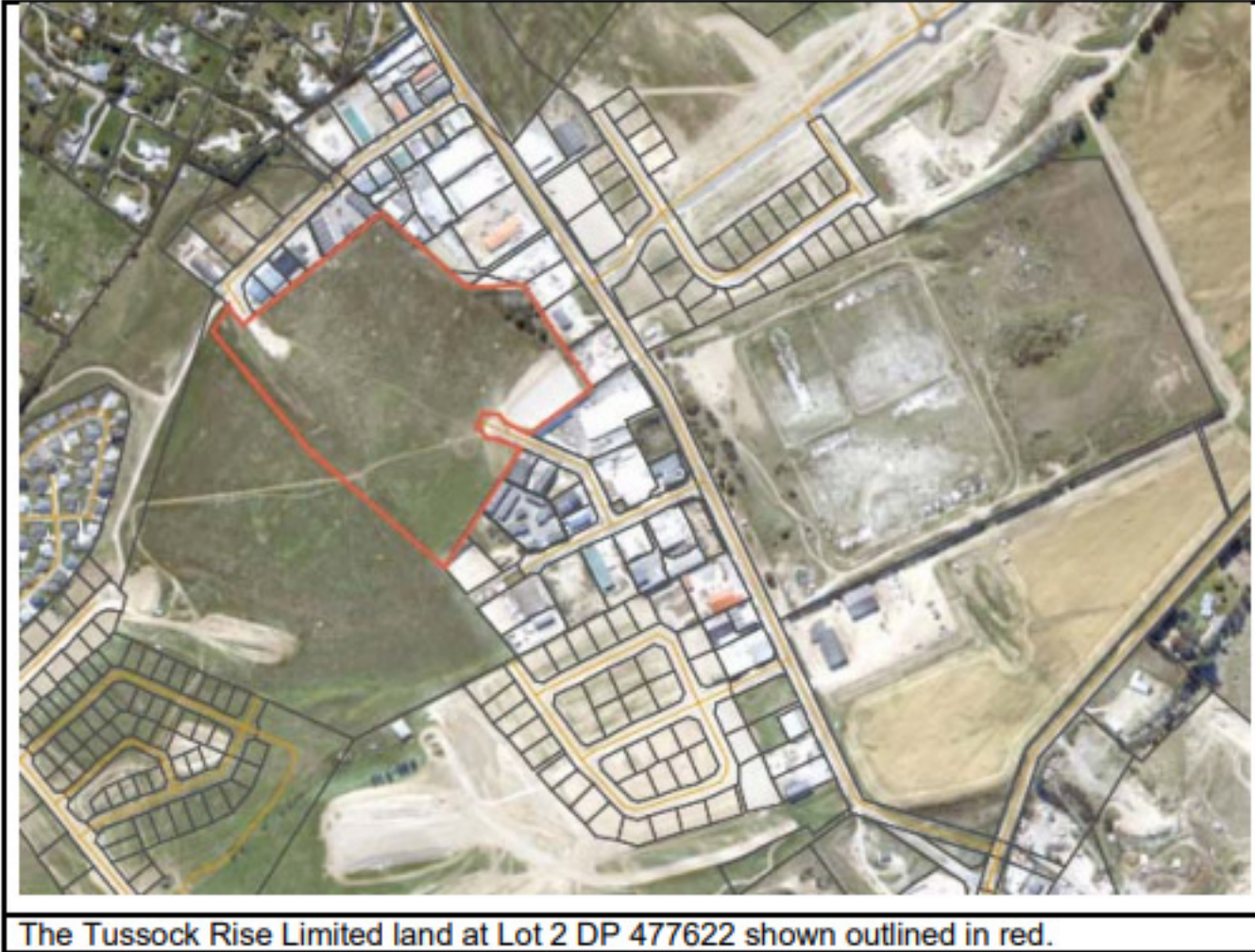
The Tussock Rise Limited land at Lot 2 DP 477622 shown outlined in red. them as Tussock Rise 104 .

168. A number of submissions were received requesting a revised zoning framework in the GIZ area in Wānaka. These rezoning requests broadly seek the same relief as that set out by Tussock Rise Limited (Tussock Rise). Given this we have considered these submissions as a group and refer to