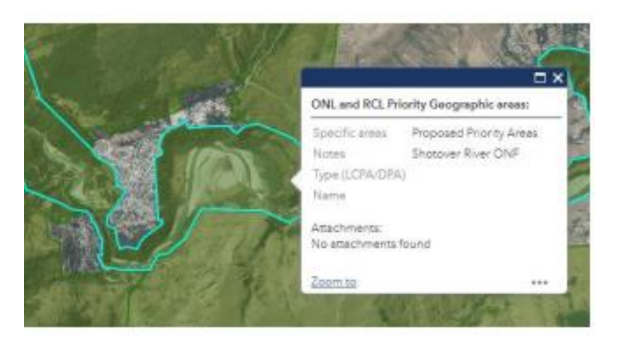
Figure 1: screenshot of Shotover River ONF boundary agreed through JWS dated 29 October 2020