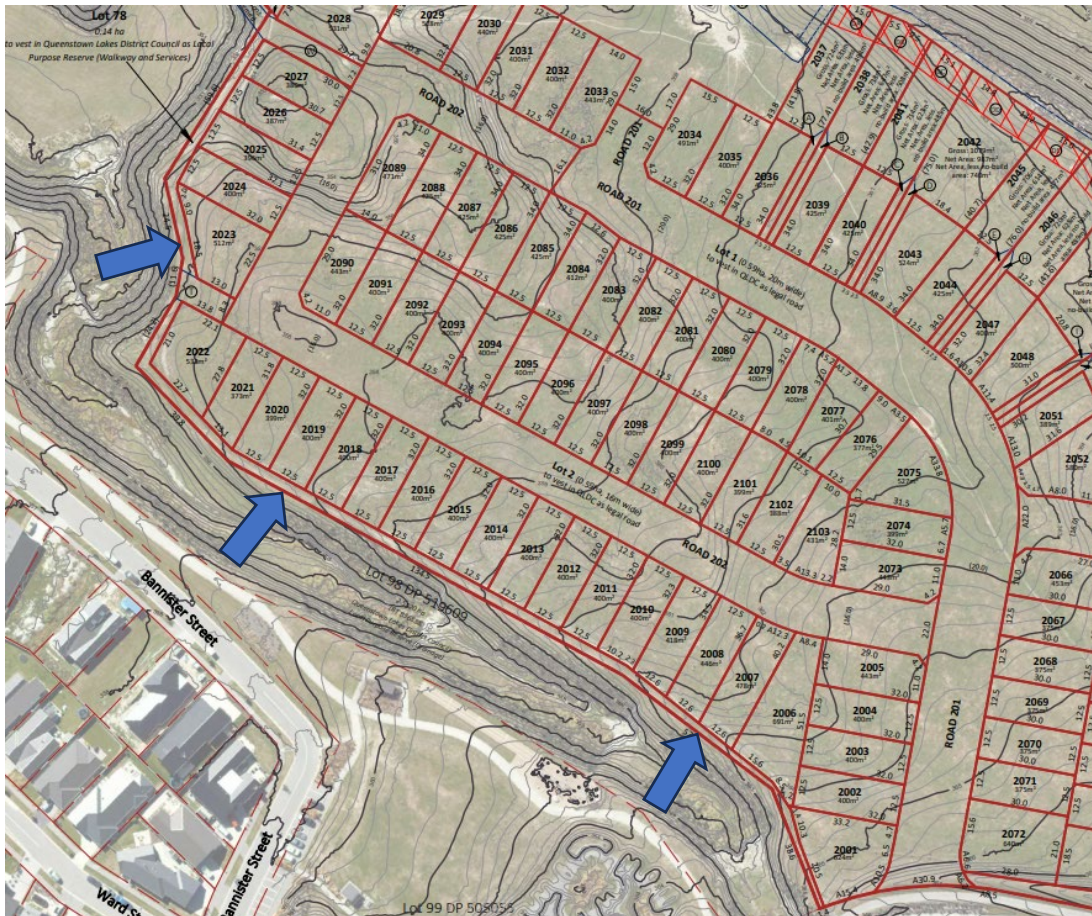
Figure 2: Extract of approved subdivision plan showing Lot 78 to vest (identified with blue arrows)