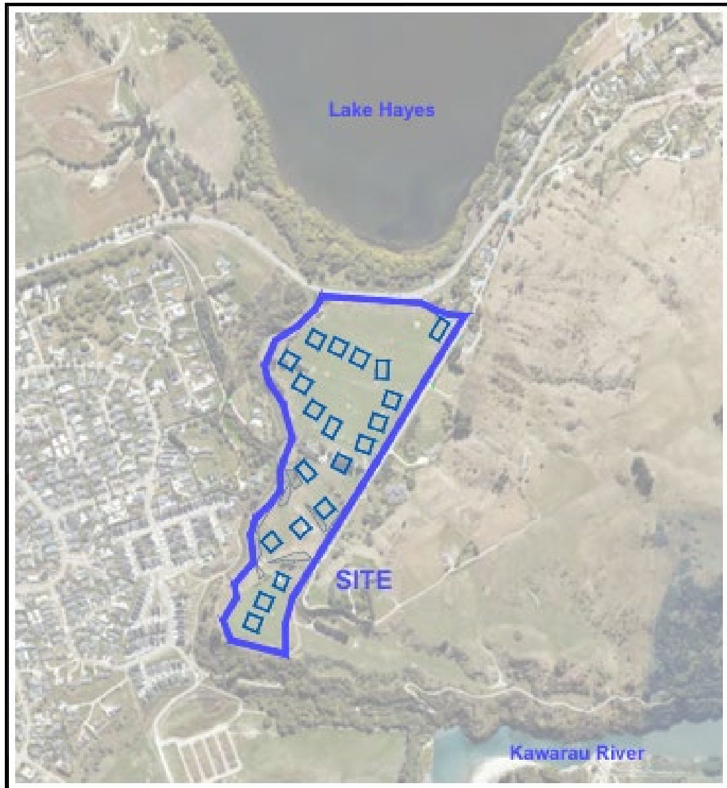
Figure 3: Map showing location of Alec Robins Road subdivision