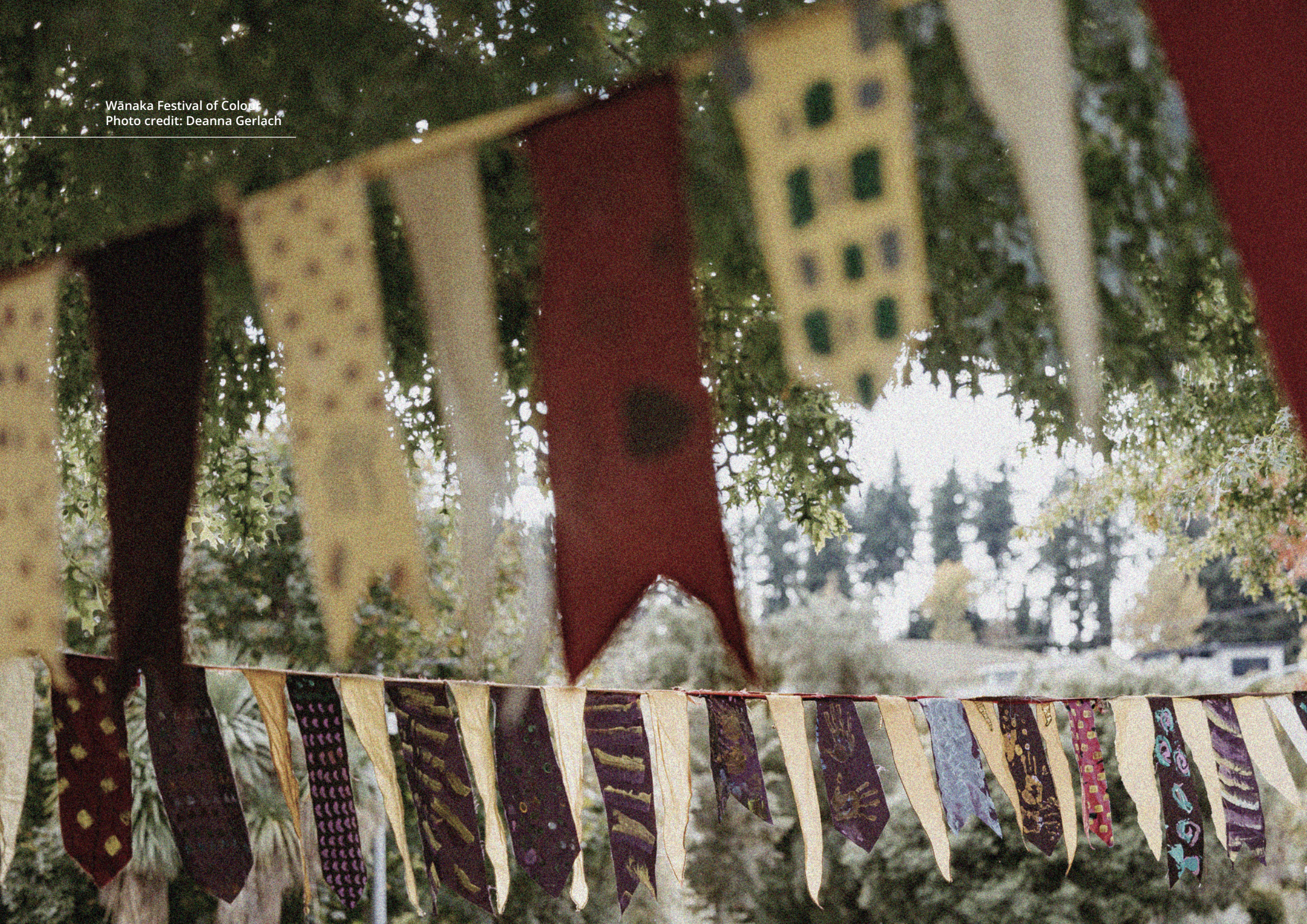
Wānaka Festival of Colours