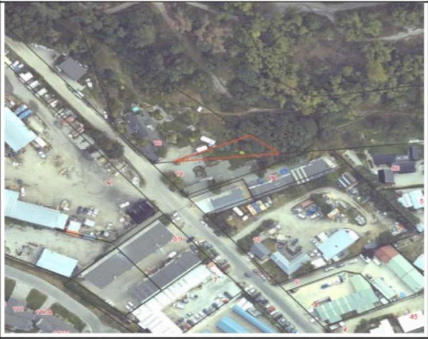
Aerial photo of subject site showing area of the M Thomas re-zoning request outlined in red.