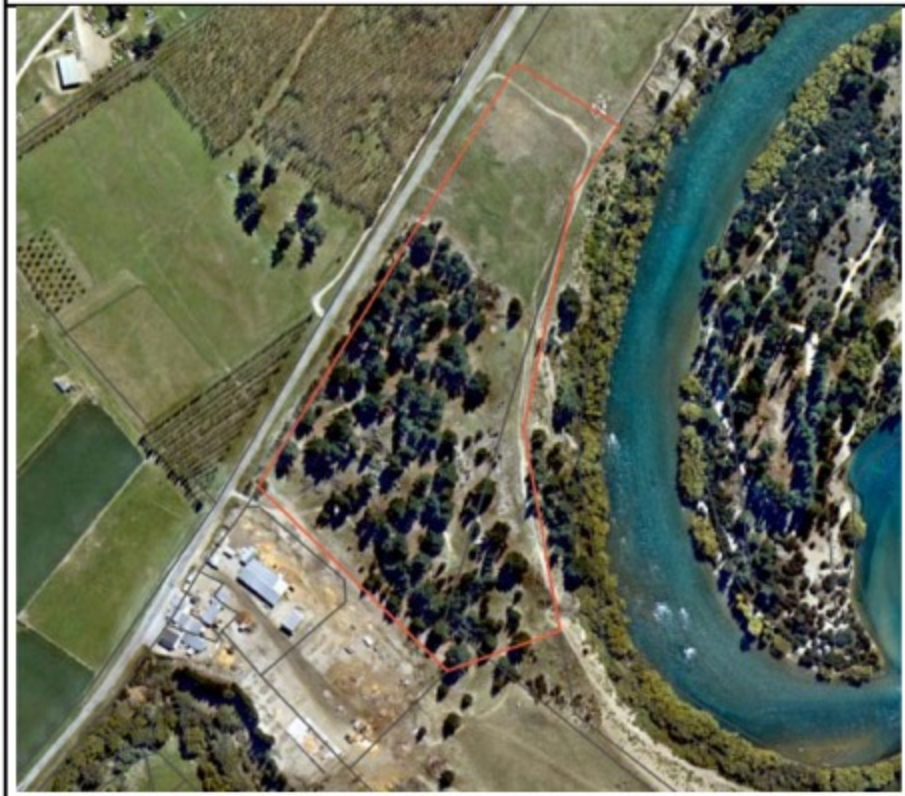
Aerial photo of subject site showing area of re-zoning request from Upper Clutha Transport Limited outlined in red.

372. While the submissions are closely related (UCT wishes to relocate its activities from its existing Main Road site to the Church Road site), they have each been addressed separately on their merits. This report only relates to the requested rezoning of the Church Road site. The Main Road site rezoning request is addressed in the Report 20.8.