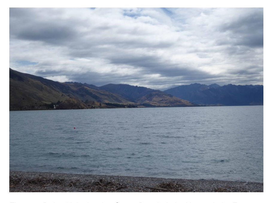
Figure 2: Raised lake level at Scotts Beach, Lake Hawea Lake Front