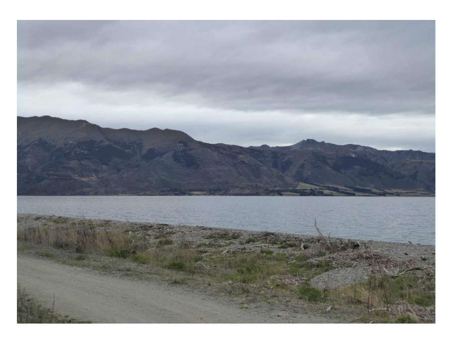
Figure 3: Raised lake level at John Creek Reserve, Lake Hawea Lake Edge