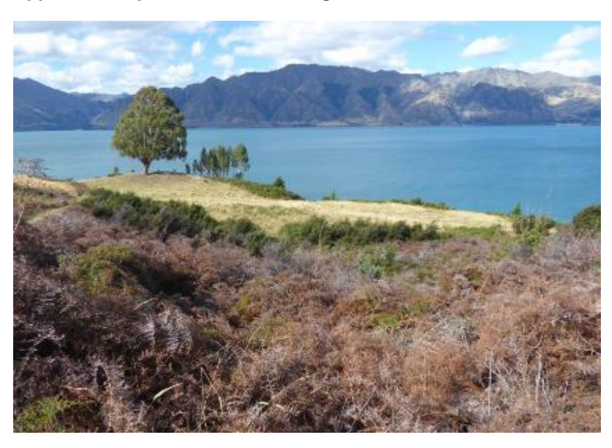
Figure 1: Raised lake level at Lake Hawea and introduced Eucalyptus trees