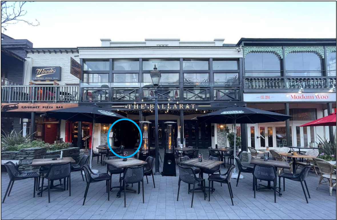
Photo 2 - Exterior view of premises with doors to the proposed TAB are indicated in red, and the principal entry door indicated in blue: