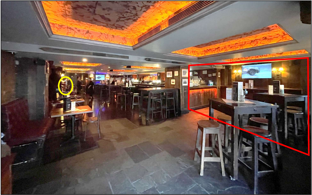
Photo 4 – Close up view of the proposed TAB area which is to consist of two (2) television screens, an ATM (intended location indicated in purple), and one (1) existing CCTV camera (indicated in green):