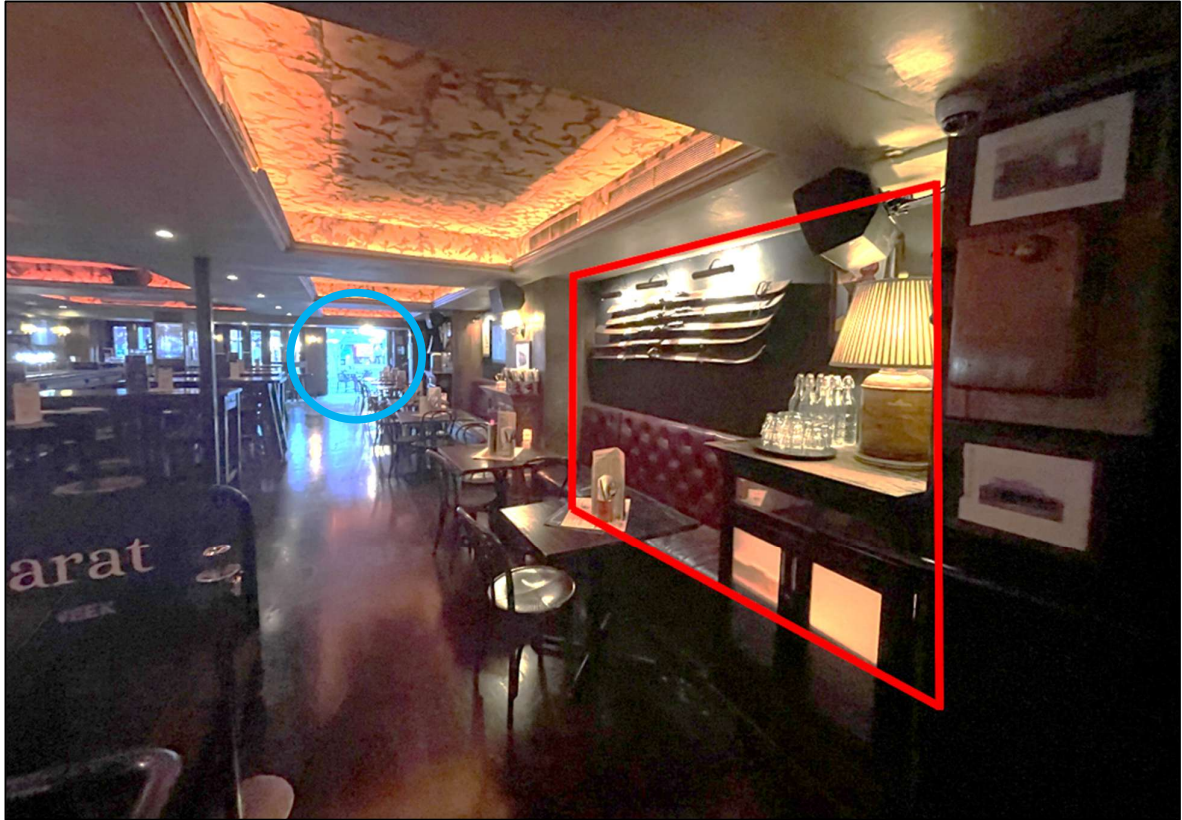
Photo 8 – View of the proposed gaming room entry from the bar. The existing, unused space is currently boarded up and is proposed to house nine (9) EGMs, along with three (3) CCTV cameras: