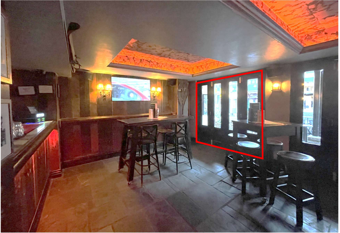
Photo 6 – View of the premises with the proposed Class 4 gaming room entrance outlined in red: