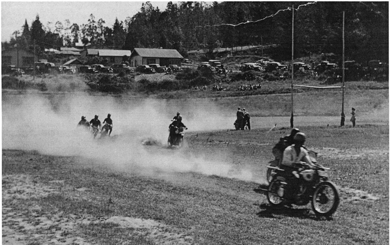
Motorbike Speedway on the Recreation Reserve.