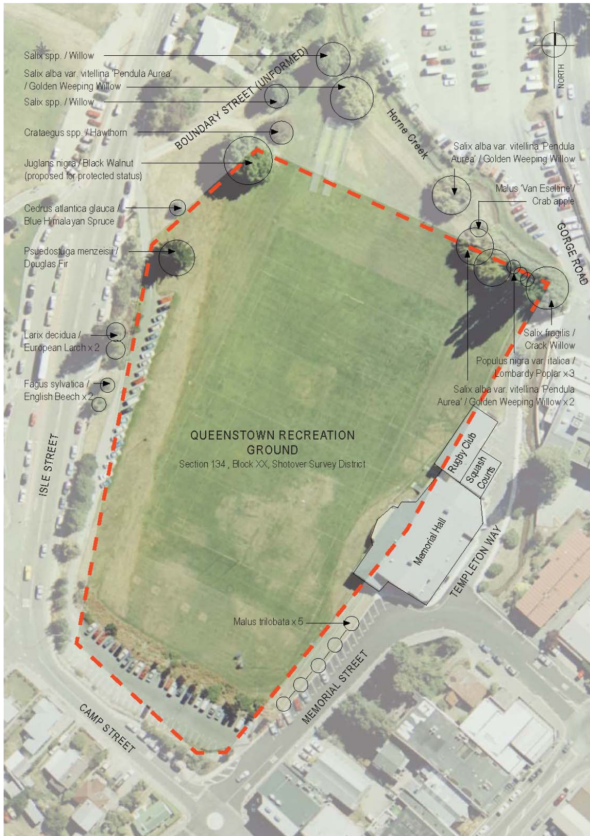
Figure 1: The Queenstown Recreation Reserve