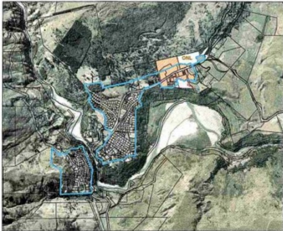
Location of ONL boundaries as proposed by Arthurs Point Outstanding Natural Landscape Incorporated (Figure 2 of their submission).