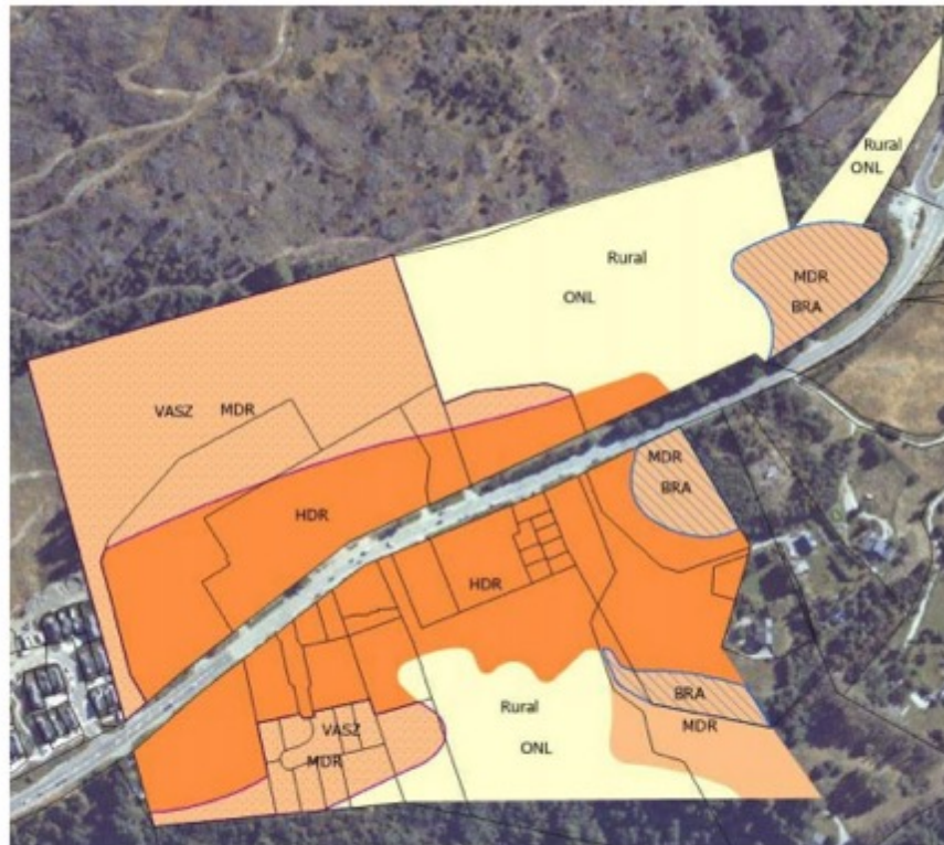
Recommended mapping (zoning and overlays) of Emma Turner for Arthurs Point North. Snip taken