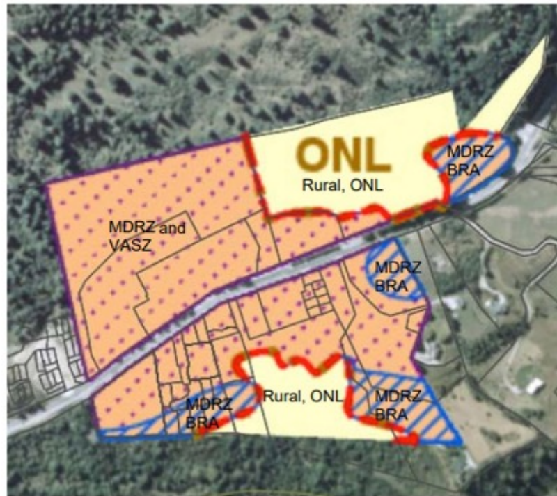
Notified PDP Zoning of Arthurs Point North as part of 3b of the Proposed District Plan.