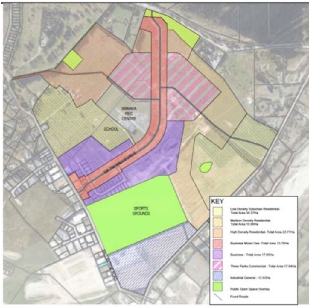
Approximate locations of re-zonings sought by Willowridge.