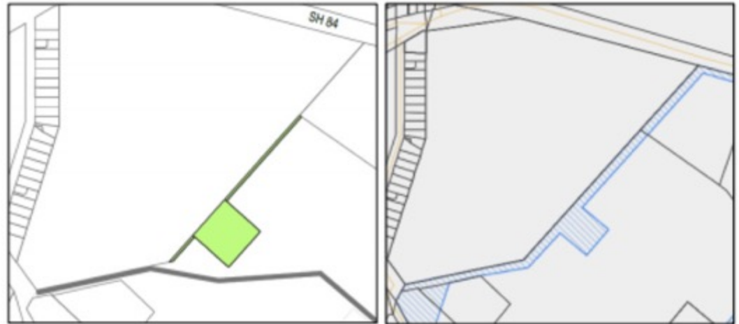
Left: Willowridge Open Space Overlay along golf course (green); Right: PDP BRA along golf course (blue stripe)

30. We understand that the square area of BRA alongside the golf course is the Kame and Kettle mound. This area was identified a