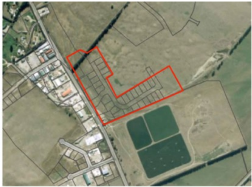
Aerial photo of subject site showing approximate area of re-zoning request as it relates to Three Parks (red border).