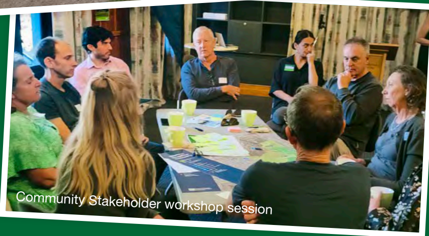
Community Stakeholder workshop session