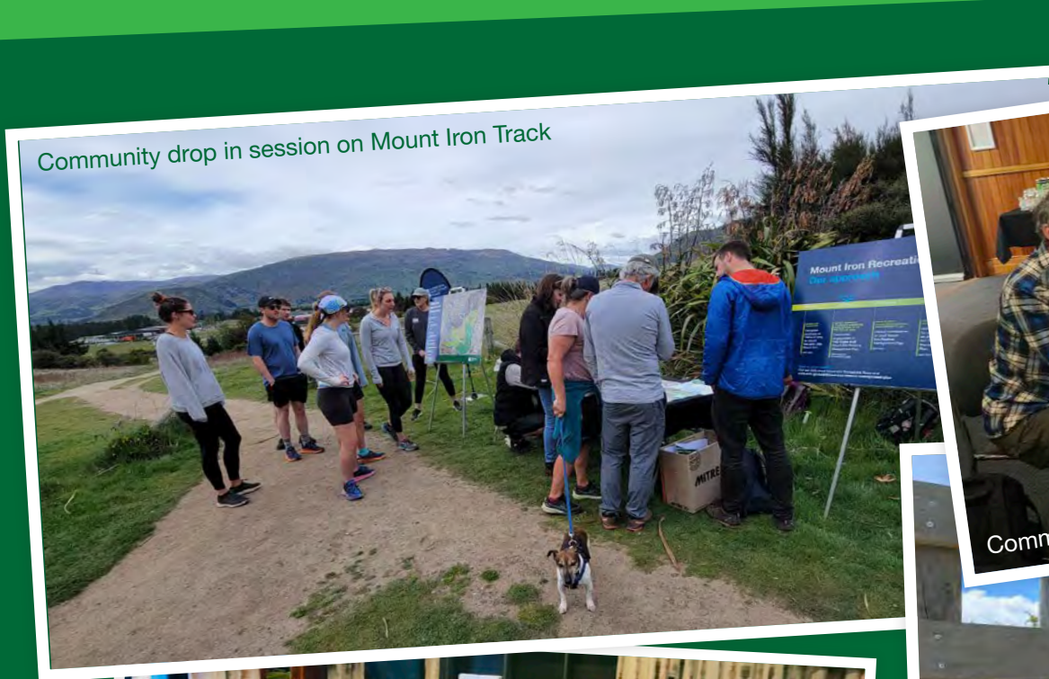
Community drop in session on Mount Iron Track