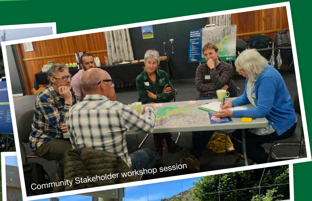
Community Stakeholder workshop session