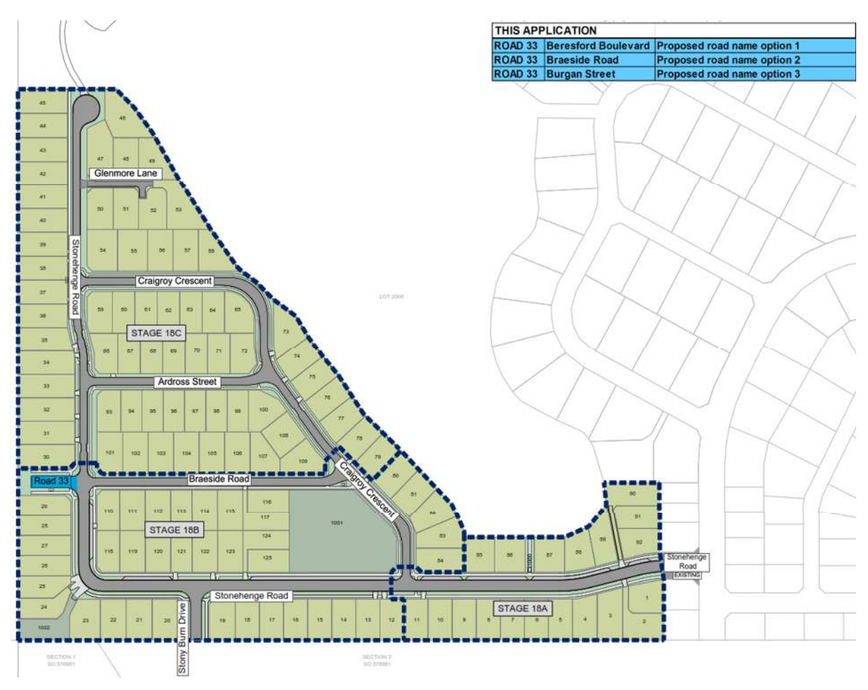
Figure 1: Road Naming Plan (Patersons)

The proposed road name meets the policies of the QLDC Road Naming Policy 2016. Policy 3.1(a)-(f) and the Selection Guidelines (Policy 5) is followed as all of the supporting information, plans and maps is included within this application. Below is an assessment of how the name meets the policy.