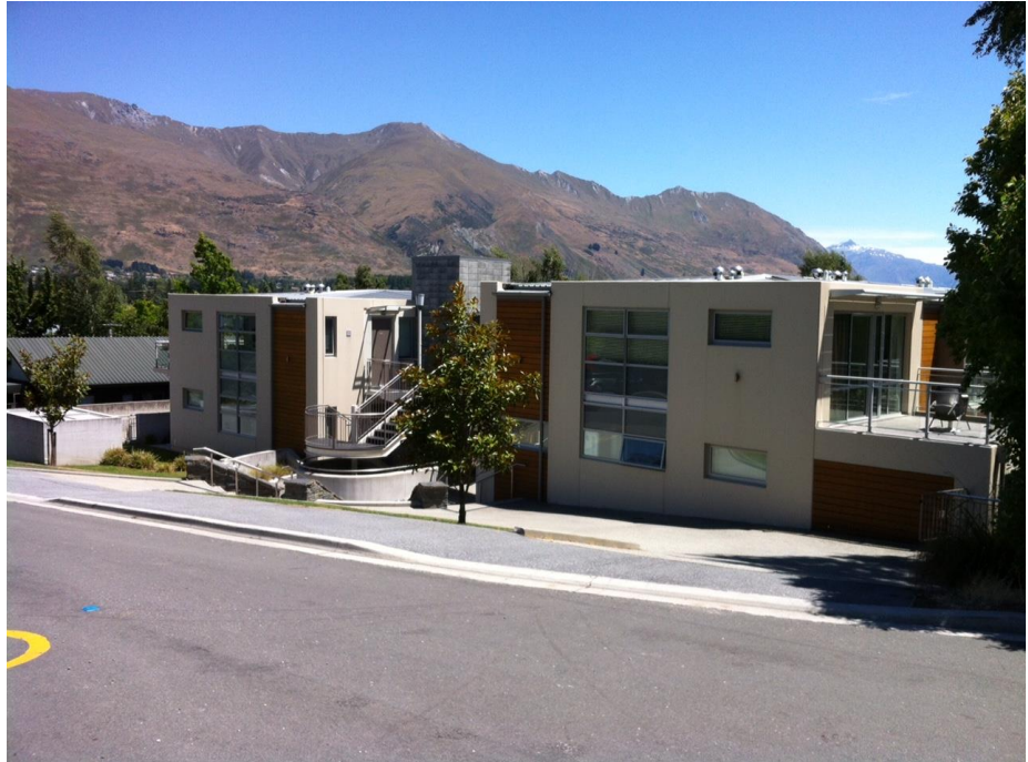
Photograph of 25-29 Warren Street (the Belvedere Luxury Apartments) – Opposite 26 Warren Street