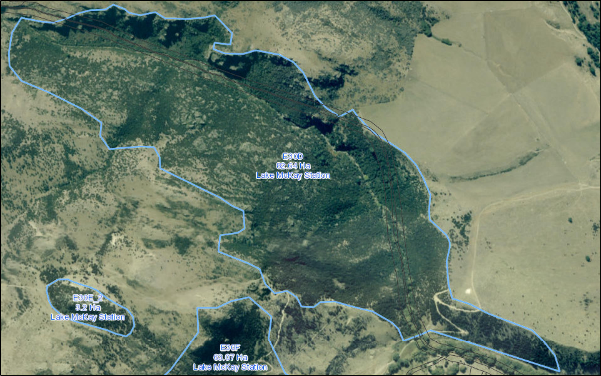
Figure 1: The area of potential significance - Luggate Crk SNA D - E30D.