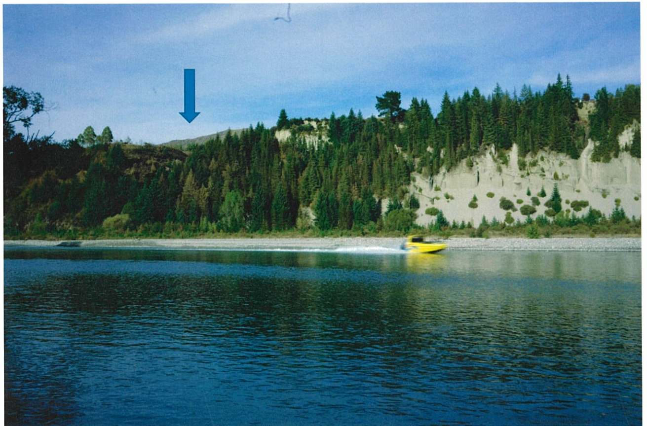
Photo from Tuckers Beach across Shotover River. Blue arrow shows approximate location of the gully included in the ONL.