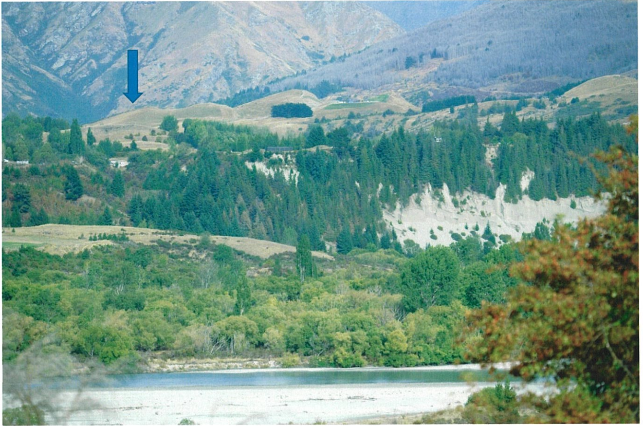
Photo from Domain Road. Blue arrow shows the “line” of the gully included in the ONL.