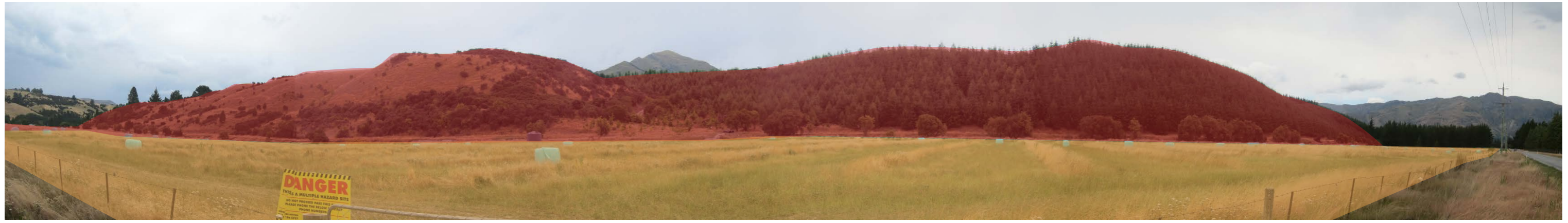
Viewpoint 5: Looking north towards the areas of high landscape sensitivity and high-moderate landscape sensitivity from Camp Hill Road.