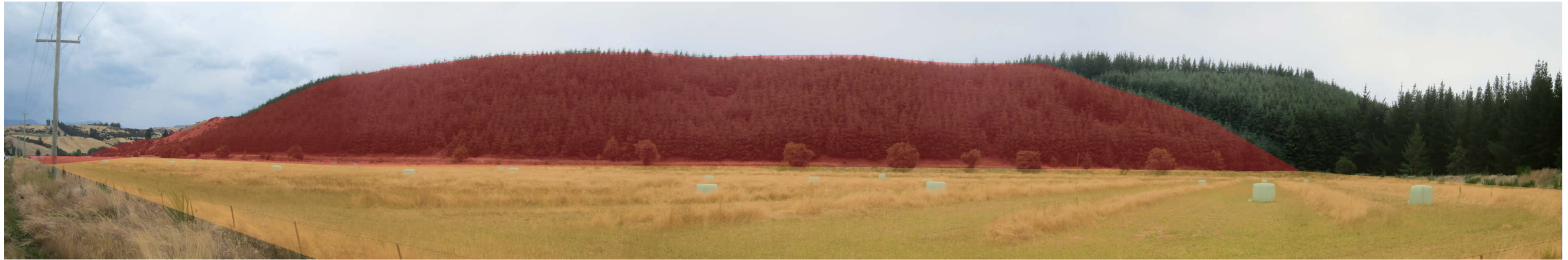
Viewpoint 6: Looking north towards the areas of high landscape sensitivity and high-moderate landscape sensitivity from Camp Hill Road.