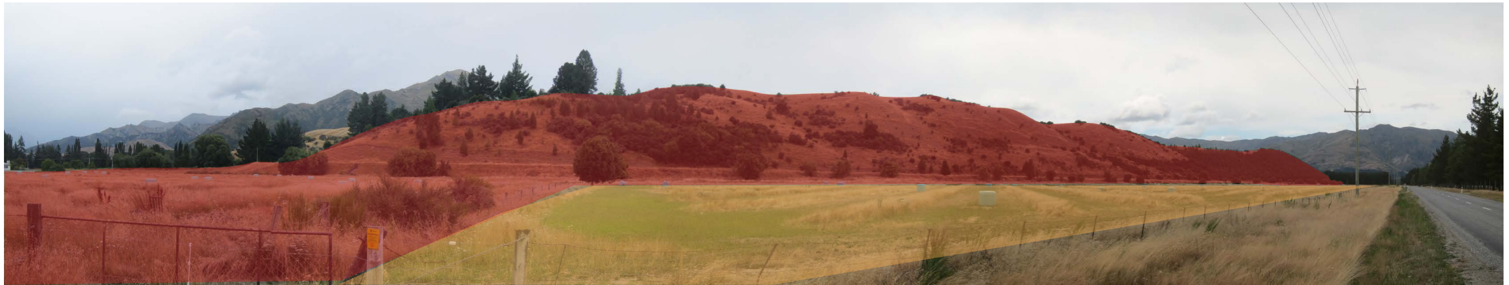
Viewpoint 4: Looking northeast towards the areas of high landscape sensitivity from Camp Hill Road.