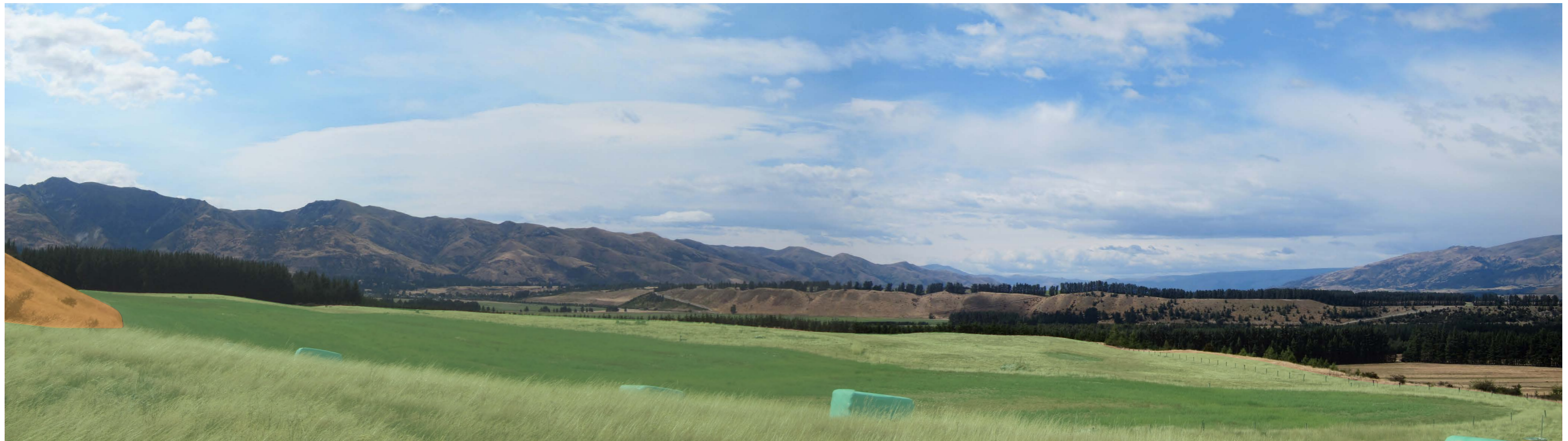
Viewpoint 2: Looking southeast over the area of low landscape sensitivity on the upper terrace. The escarpment is considered to be a high-moderately sensitive landscape.