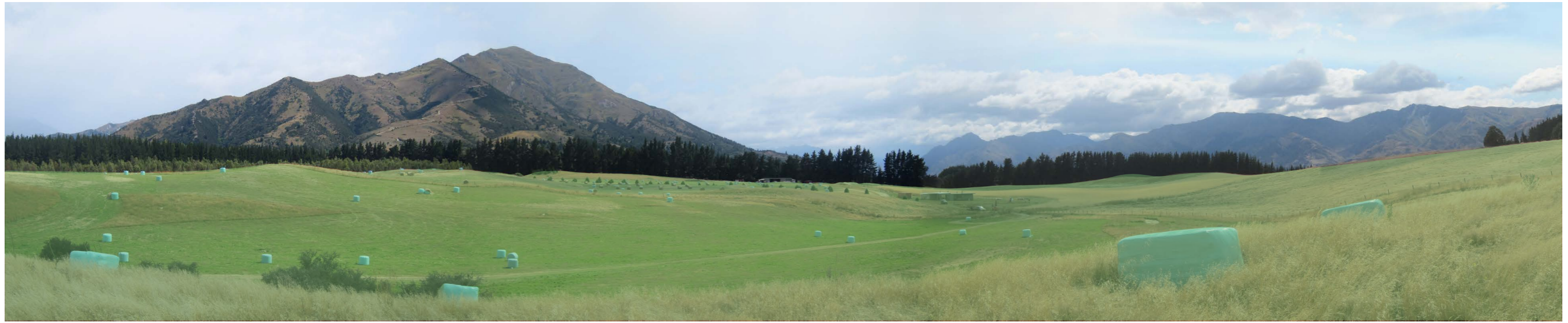
Viewpoint 1: Looking northwest over the area of low landscape sensitivity on the upper terrace.