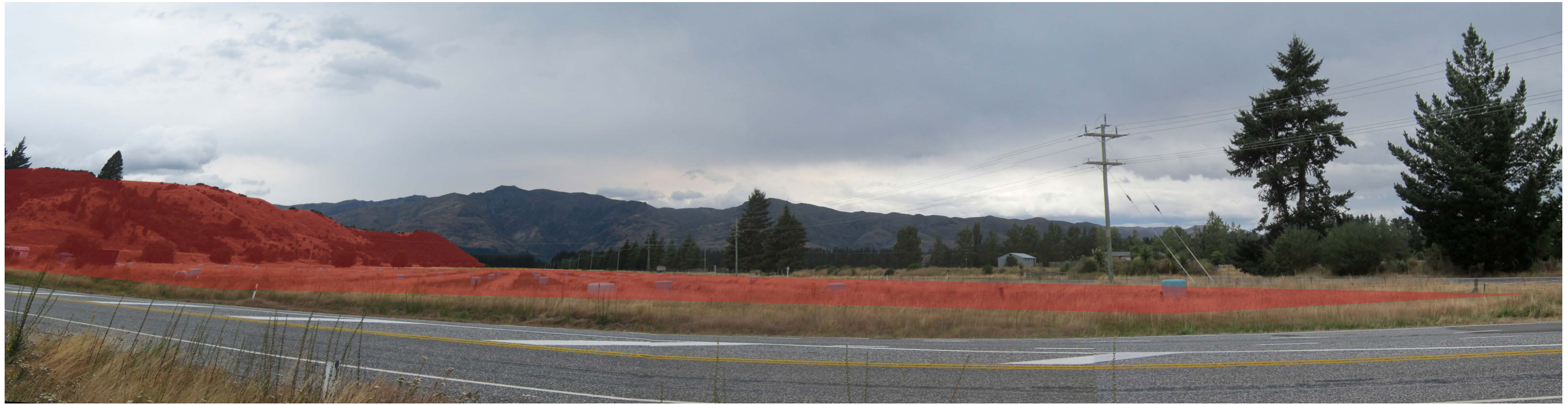
Viewpoint 3: Looking east towards the areas of high landscape sensitivity from SH6.