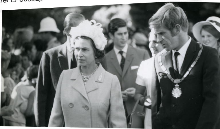
The Queen with Mayor Warren Cooper, 1970 (ref EP3089f).