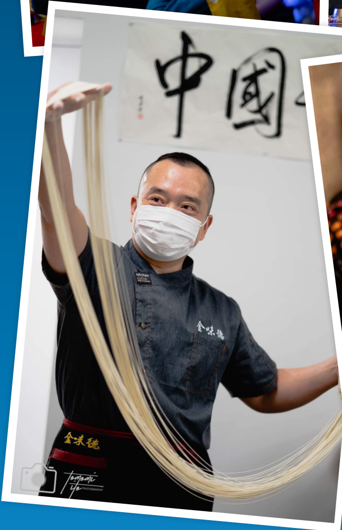
Celebrating our global village Heaps of locals with backgrounds in different countries around the world came together in early October for the Queenstown Multicultural Festival. There were live performances, stunning national costumes, yummy food, crafts and kids' games throughout a hugely entertaining day. Thanks to everyone who helped make this happen!