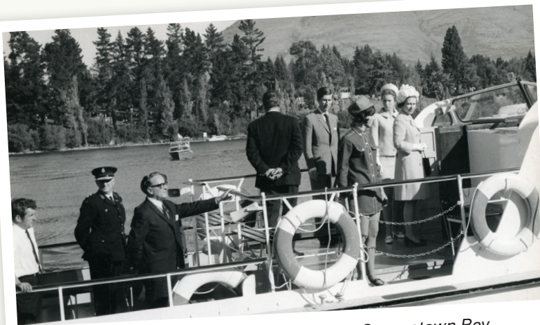
The Royal Family on board 'Fiordlander' in Queenstown Bay, 1970 (ref EP3089L).

Like millions around the world, people in our district took time in September to reflect on the life and reign of HM Queen Elizabeth II. Council offices and venues remained closed on the special public holiday to coincide with the State Memorial Service in Wellington. Here we remember the Queen's visits to our district in 1970 and 1990.