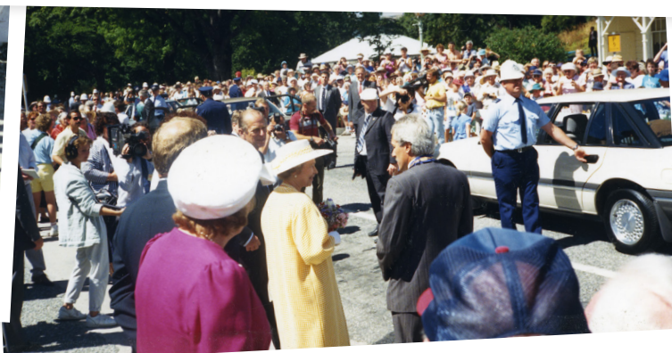
The Queen talks to Mayor David Bradford in Arrowtown, 1990 (ref EP2146).