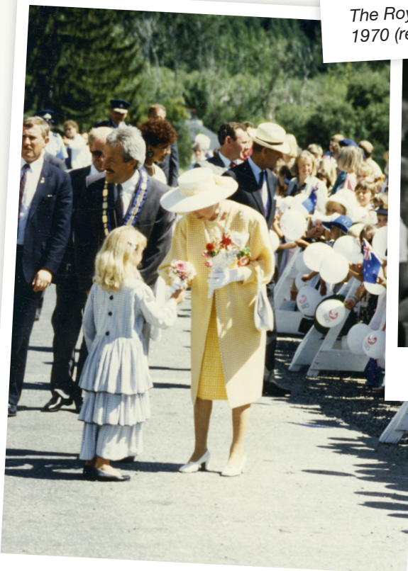
Queen Elizabeth II visits Arrowtown, 1990 (ref EP2142).