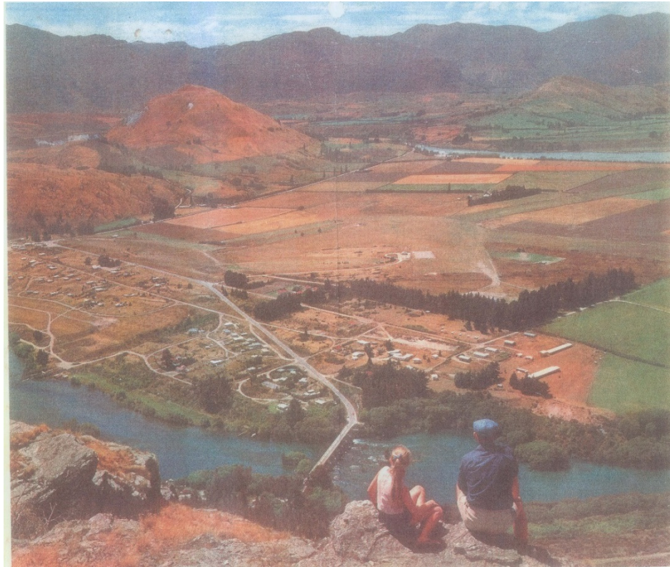
View of Arranmore circa 1966

3.5 We moved to the property when our children were pre-school age and being close to the Grandparents (200m away) was a great benefit. The children went to the Play centre on the site where the primary school now stands. Remarkables Primary opened in February 2010, the children are currently enrolled there and it is a short walk to school.