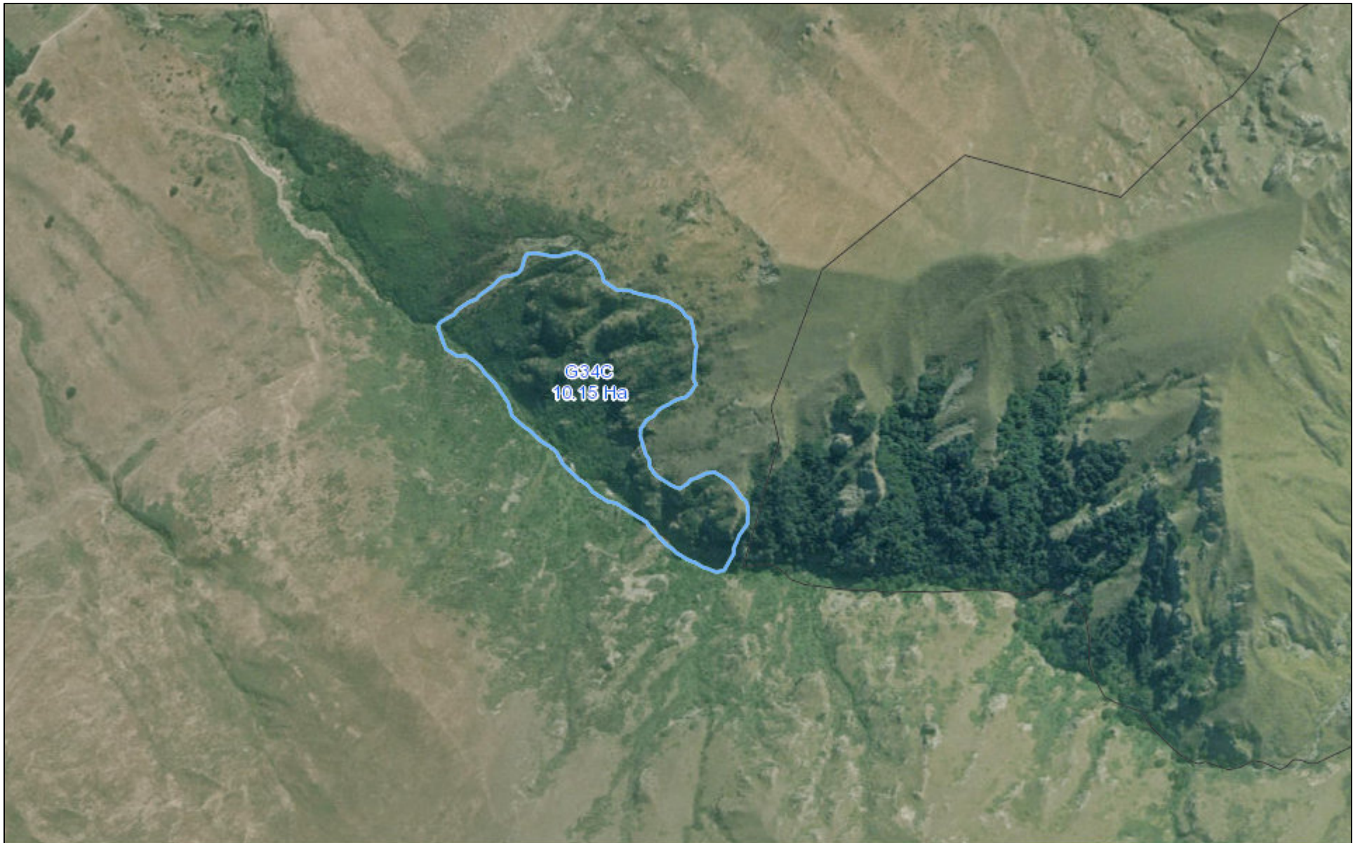
Figure 1: The area of potential significance - Alphaburn SNA C - G34C