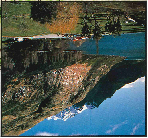
The Village Site

and Remarkable Enterprises Limited. Their commitment throughout the planning stages has been to an excellence in conception and design unmatched by anything in New Zealand. They believe that its realisation will produce a luxury resort of true international standard, one which will offer a unique experience for all who visit it.