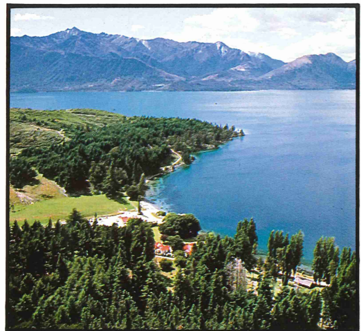
Walter Peak Resort Site

Walter Peak Destination Resort will be a world class luxury resort located in the heart of New Zealand's scenic South Island. Just minutes by boat from Queenstown, the site offers a 360 degree panorama of spectacular mountains, tranquil stretches of