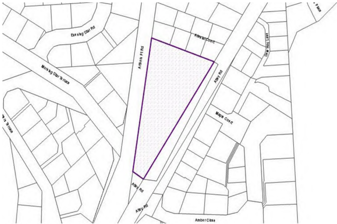
Figure 2-13 Recommended amendment to Planning Map 39a