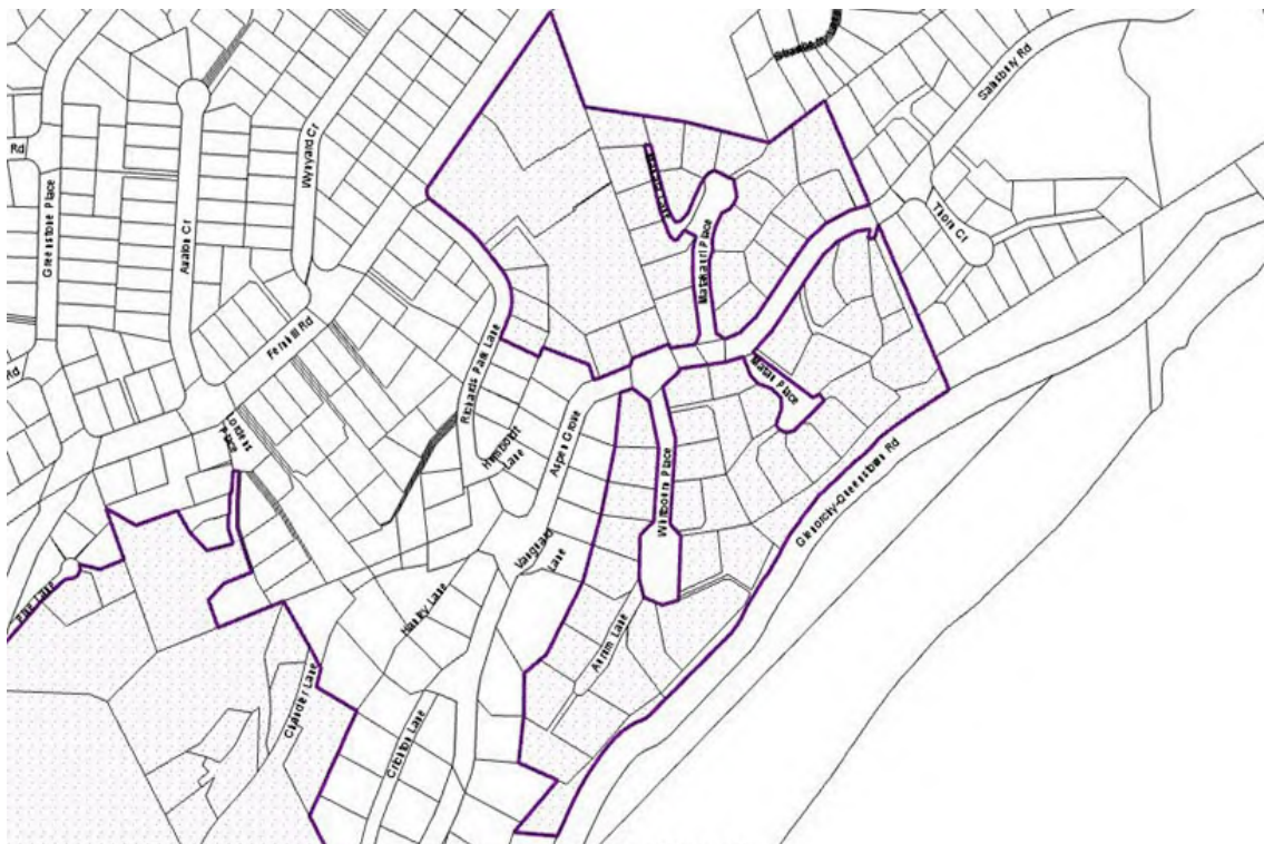
Figure 2-8 Recommended amendment to Planning Map 34

285. Figure 2.8 below shows the extended VASZ we are recommending along with other notified and recommended VASZ in the immediate vicinity.