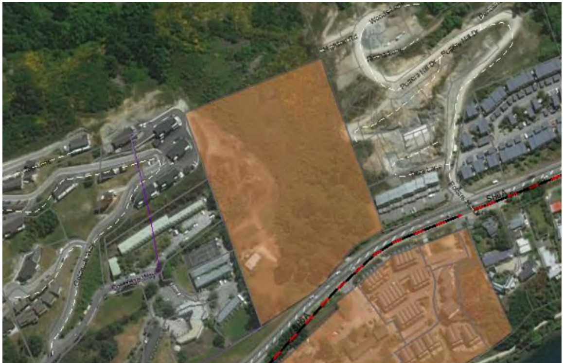
Figure 2-1 Aerial Photograph of 634 Frankton Road showing land subject to the submission in brown (above Frankton Road)

224. Mount Crystal Limited sought a VASZ over 2.736 ha of land zoned MDRZ 435 at 634 Frankton Road, Frankton 436 . Ms Devlin evaluated the request in Section 24 of her Evidence in chief, recommending that the request be accepted. The land subject to this submission is shown in Figure 2-1 below.