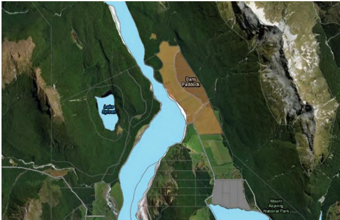
Figure 2-11 Aerial Photograph showing land subject to the submission in brown