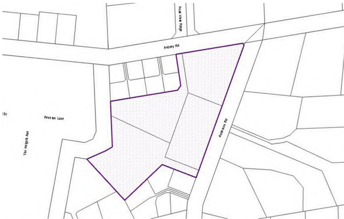
Figure 2-15 Recommended amendment to Planning Map 20