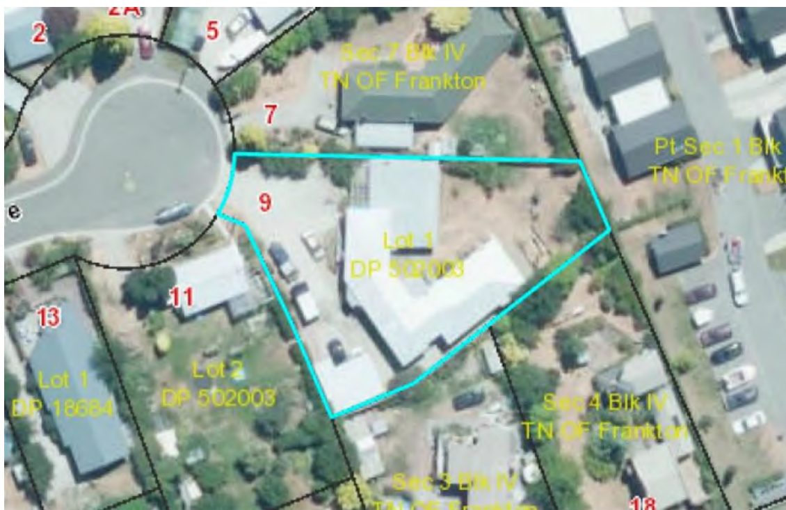
Figure 2-9 Aerial Photograph showing land subject to the submission outlined in blue

286. Delos Investments Limited sought a VASZ over 1118m 2 of land zoned LDSRZ at the end of a short cul-de-sac (Southberg Avenue), off State Highway 6, in Frankton. There were no other submitters or further submitters in relation to this site. Ms Devlin evaluated the request in Section 26 of her Evidence in chief, recommending that the request be rejected. The land subject to this submission is shown on Figure 2-9 below.