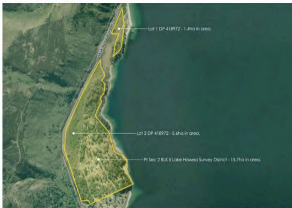
Figure 2-10 Aerial Photograph showing Lot 1 DP 418972 – the northernmost site outlined in yellow, which is subject to the submission

298. There has been a somewhat complex submission history regarding the Lake Hāwea Holiday Park, and adjoining areas within Glen Dene Station, which we will not fully detail here 518 . The land subject to this submission shown on Figure 2-10 below.