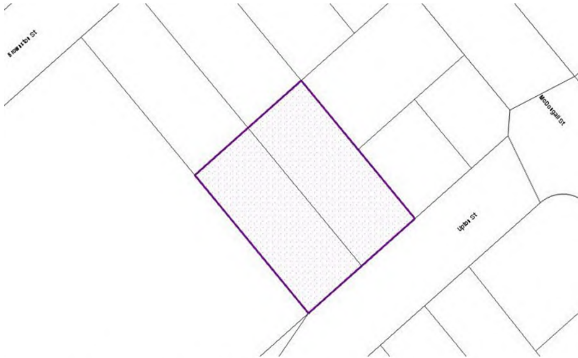
Figure 2-14 Recommended amendment to Planning Map 21