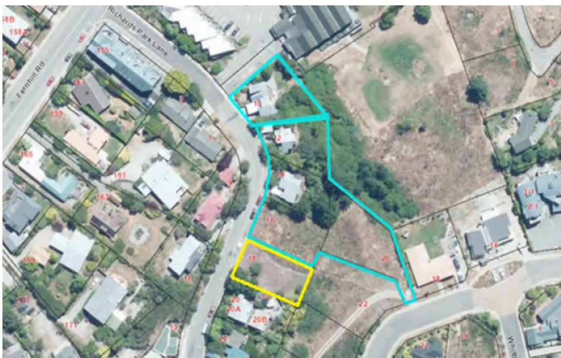
Figure 2-7 Aerial Photograph showing VASZ extension sought by the submitter outlined in blue and property owned by the further submitter outlined in yellow