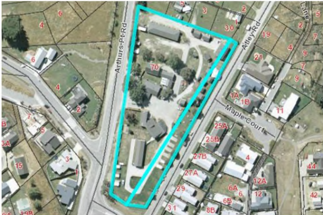
Figure 2-12 Aerial Photograph showing land subject to the submission outlined in blue

362. SJE Shotover Limited requested that a VASZ be applied to an area of 1.1369 ha, over the established Arthurs Point Holiday Park at 70 Arthurs Point Road, Arthurs Point within the LDSRZ. The land subject to this submission is shown on Figure 2-12 below.