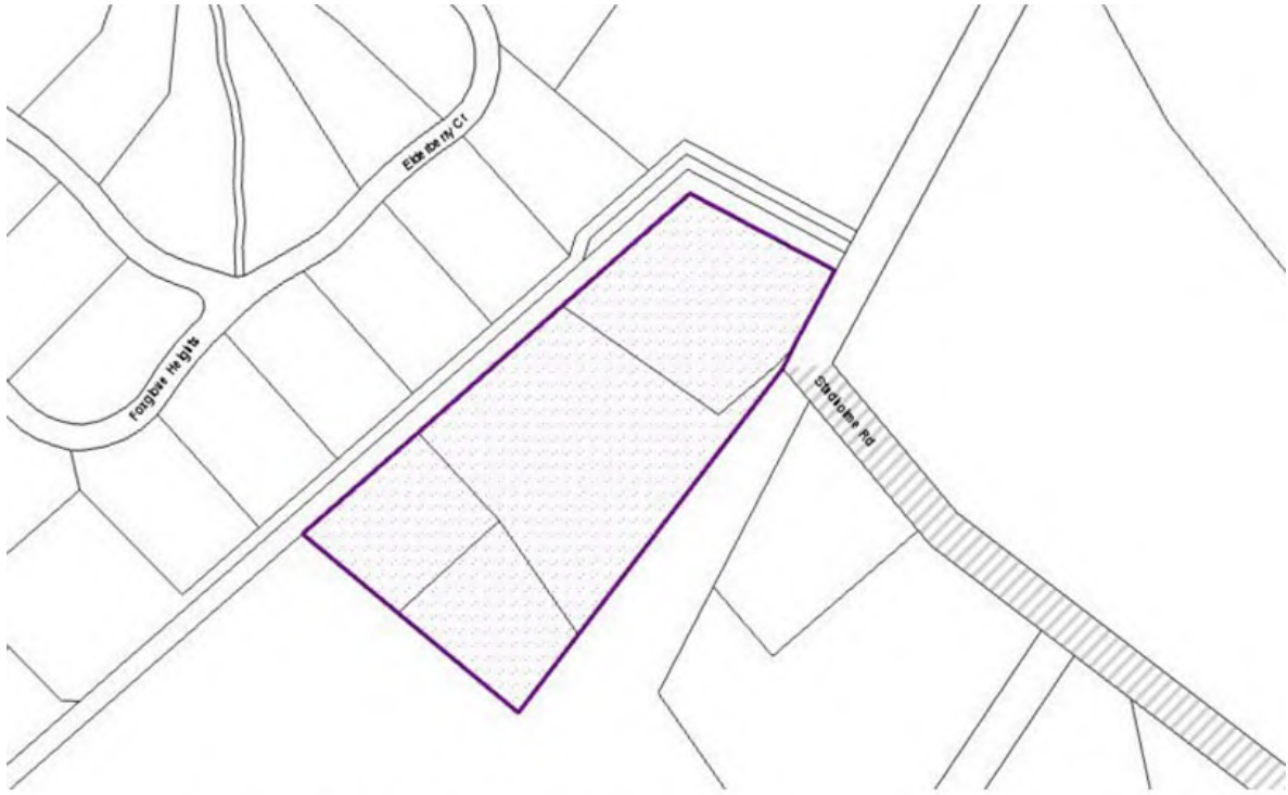
Figure 2-16 Recommended amendment to Planning Map 22