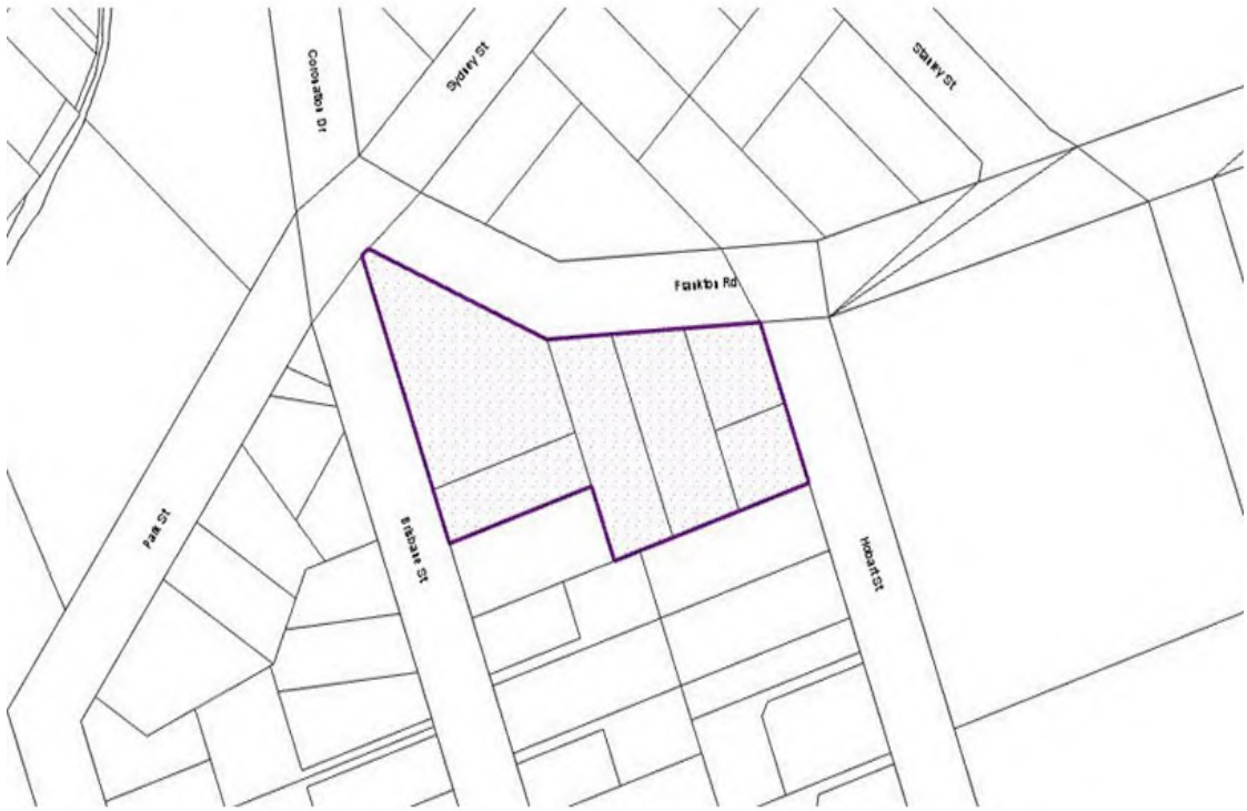
Figure 2-4 Recommended amendment to Planning Maps 35 and 36