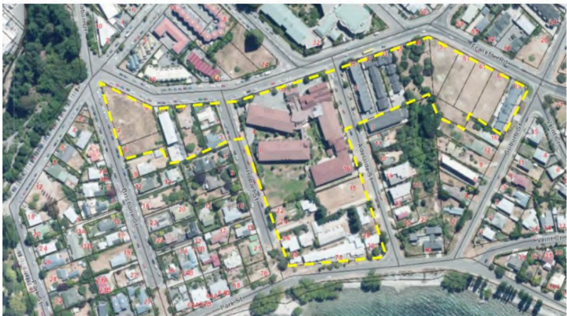
Figure 2-3 Aerial Photograph showing land subject to the submissions outlined in yellow

232. Three submissions have been received from Greenwood Group Ltd, Millenium & Copthorne Hotels NZ Limited and Shundi Customs Limited seeking a VASZ over approximately 4 ha of land zoned MDRZ and HDRZ on the south side of Frankton Road between Brisbane and Suburb Streets. Ms Devlin evaluated the request in Section 30 of her Evidence in chief, recommending that the request be rejected. The land subject to these submissions is shown in Figure 2-3 below.