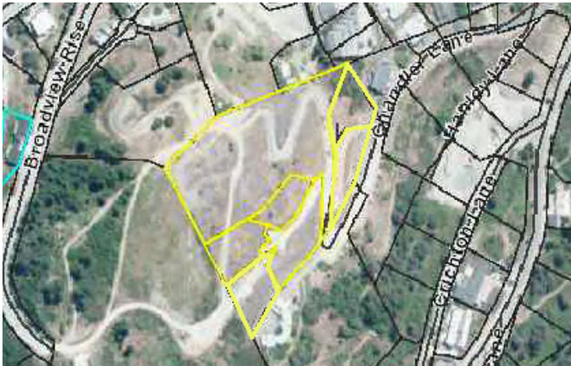
Figure 2-5 Aerial Photograph showing VASZ extension sought by the submitters outlined in yellow