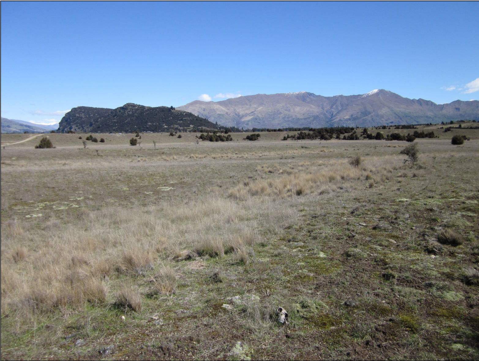
Figure 2: The potential area of significance on the Crosshill Farm property.