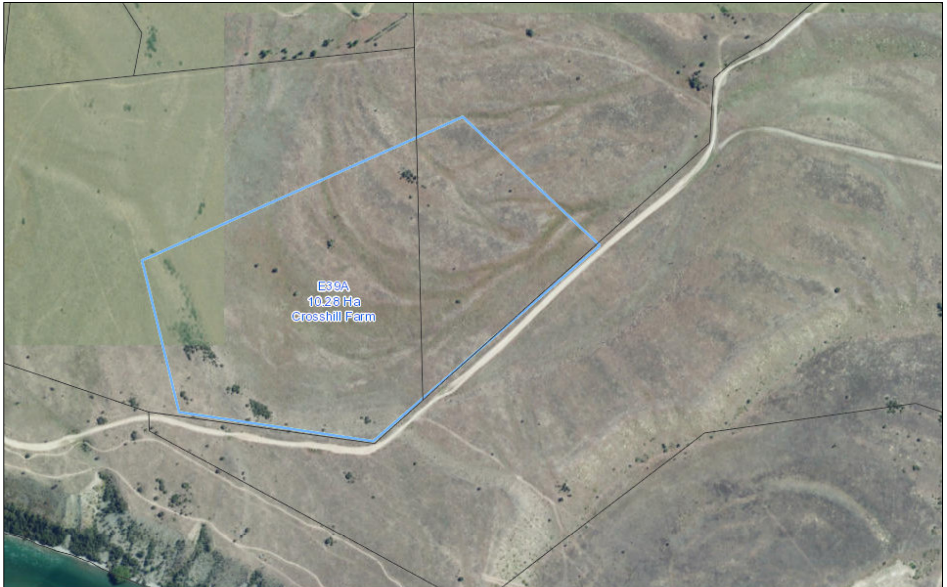
Figure 1: The area of potential significance - Crosshill SNA A - E39A