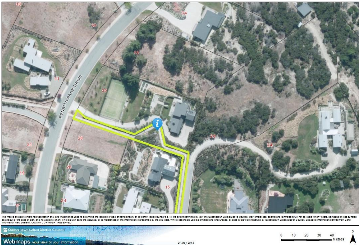
Figure 3 – Lot 116 DP 27003 Shown in Yellow.