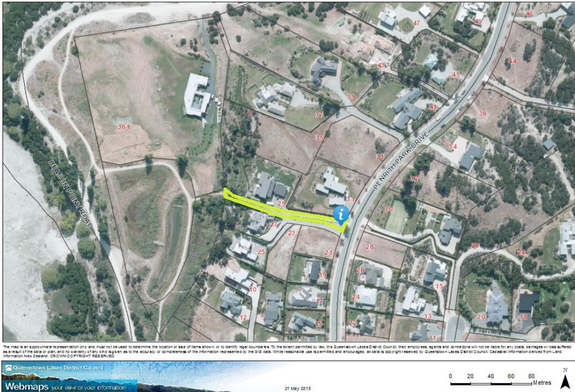
Figure 2 – Lot 117 DP 27003 Shown in Yellow.