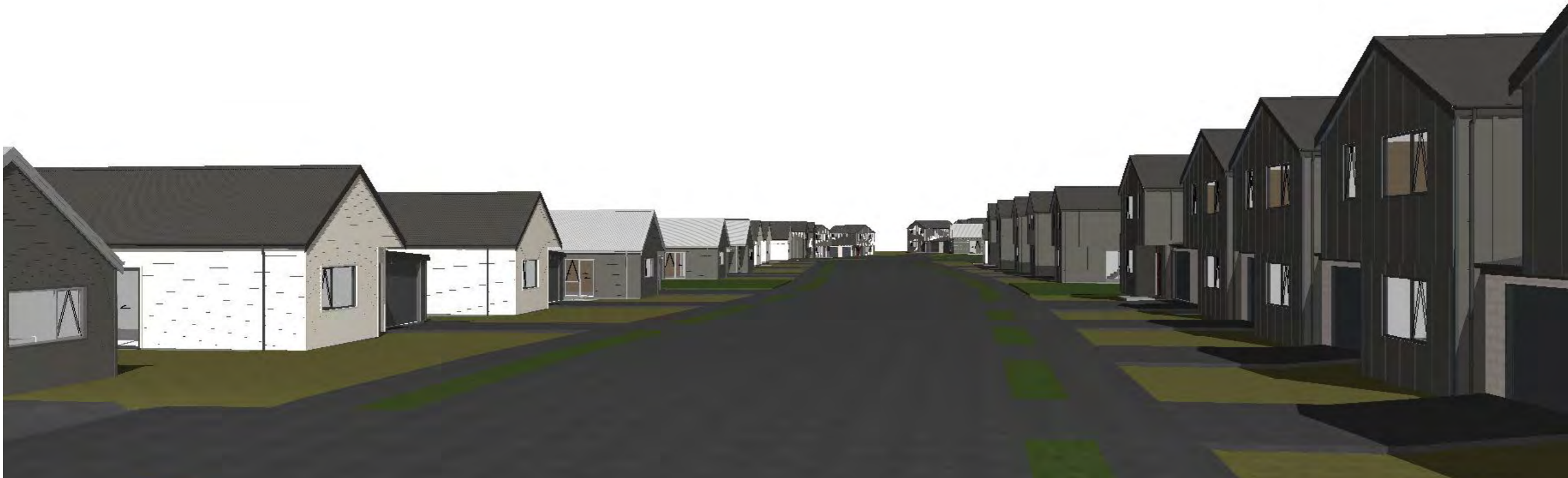
View Towards Cul-de-sac