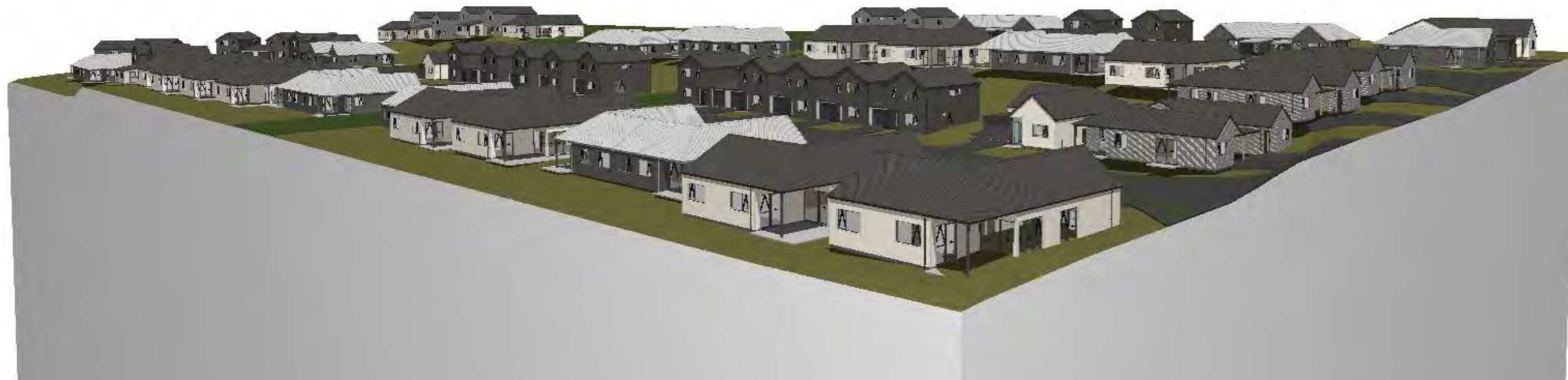
View From the North East Corner