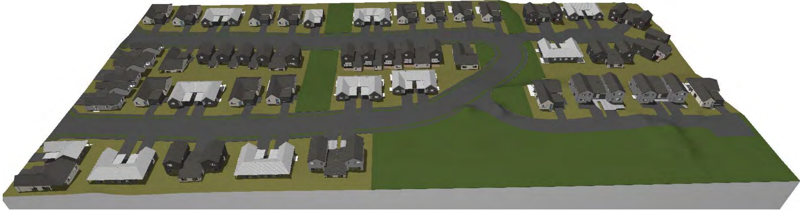
Site Overview From the West