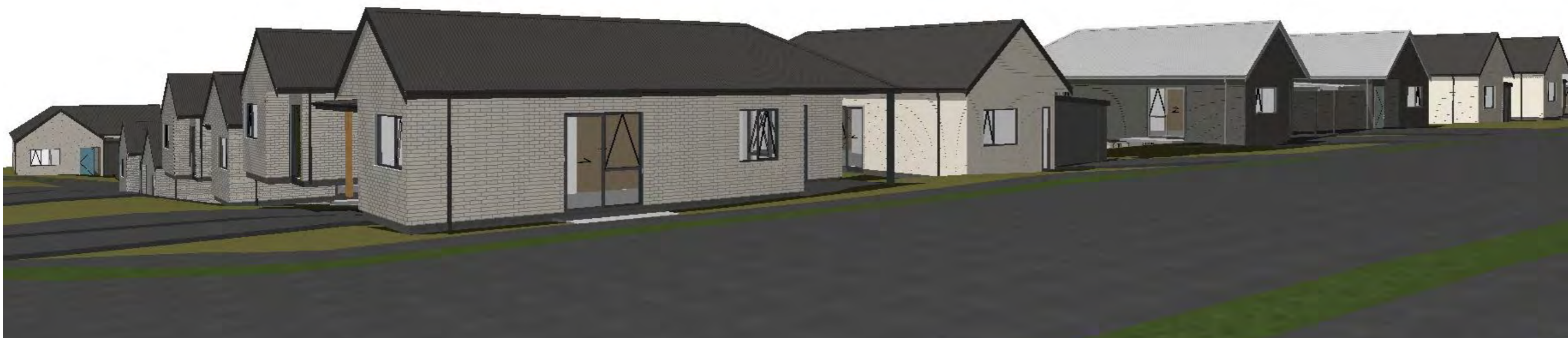
View From the South West Corner