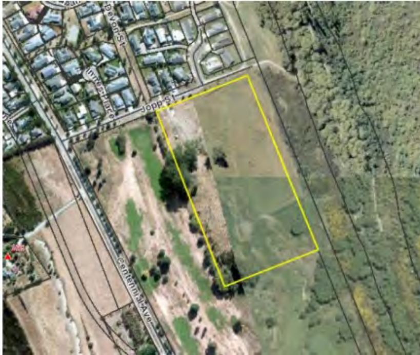
Figure 1: Lot 2 DP300390