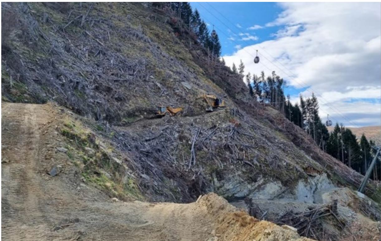
Mitigation works in progress on Ben Lomond Reserve (above)

Relatedly, Mayor Glyn Lewers today (20 Oct) approved a 28-day extension to the current local transition period following September's extreme weather event. "This is the quickest, most effective way to mitigate, manage and assess safety on Ben Lomond Reserve, adjoining reserves and other areas impacted by the weather event while recovery work continues," said Mayor Lewers. Our Weather Event – September 2023 webpage should be updated shortly with this new information on the recovery period extension.