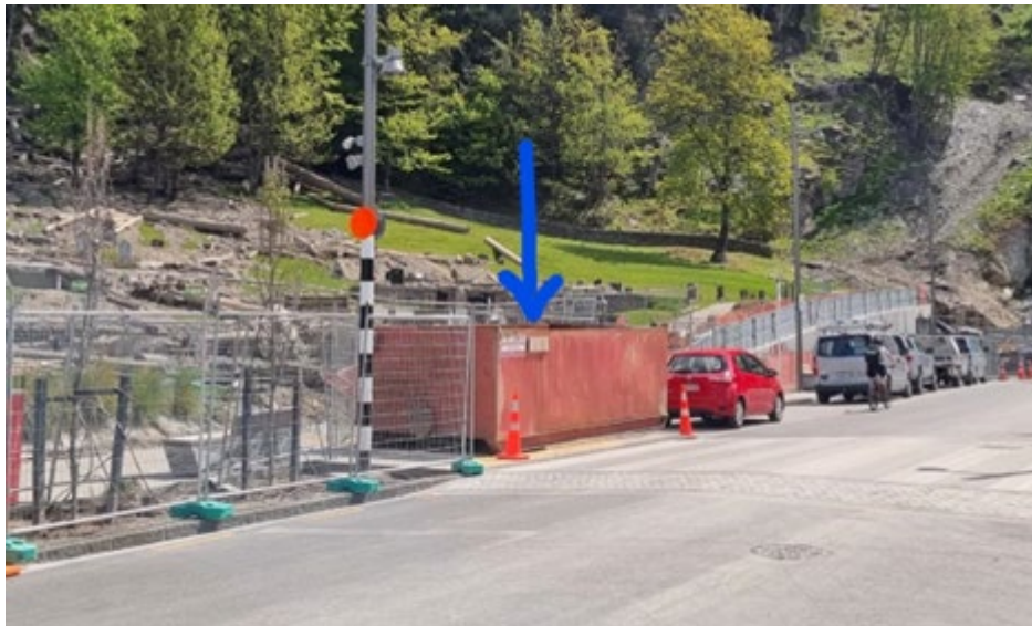
Temporary sediment tank along Brecon Street (above)

Last but certainly not least, we asked for your feedback on whether email updates regarding the cemetery restoration progress were sufficient or if a public information session (either online or in person) was preferred. Nine respondents indicated email updates were fine, and twelve respondents indicated they would like to attend an information session. From this feedback, we will try to organise an online information session and will send around a link to everyone when ready.