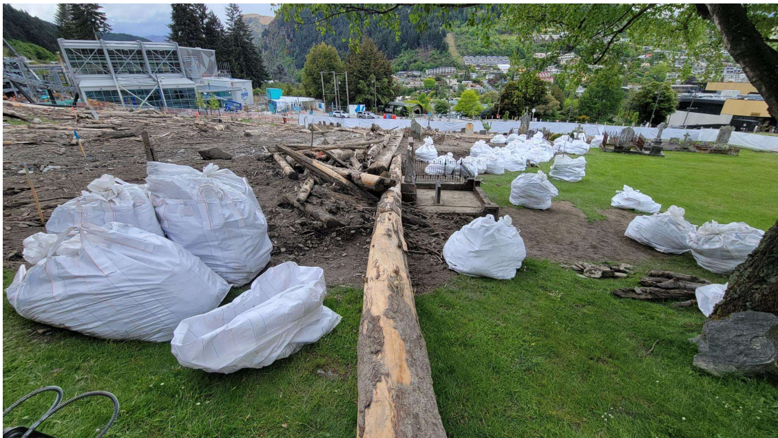
1200kg bags are being mostly hand-filled with material and will then be craned offsite (above).