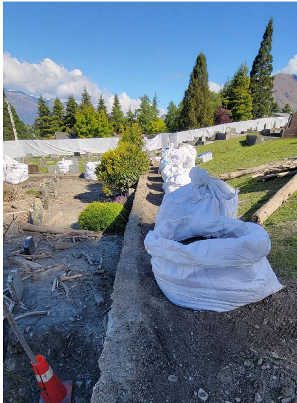
Hand-filled bags being lined up, ready to be craned offsite (above)