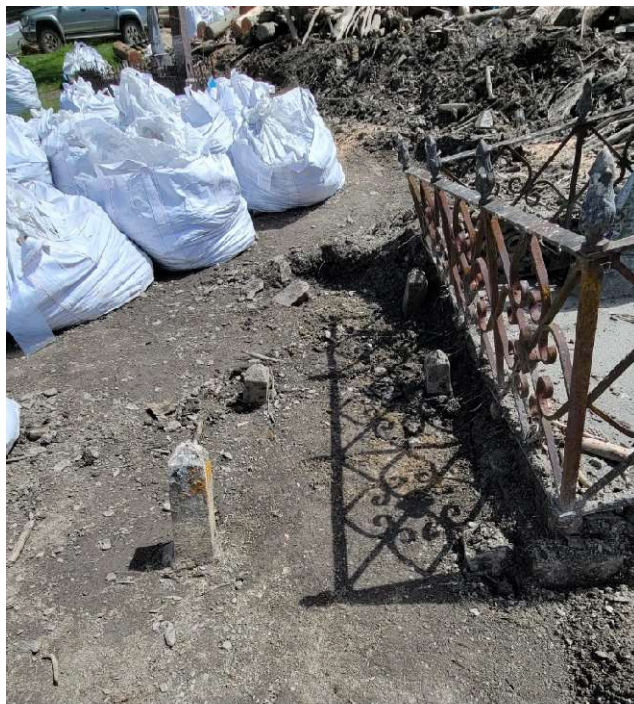
Grave features are very carefully being excavated by hand/shovel (above).