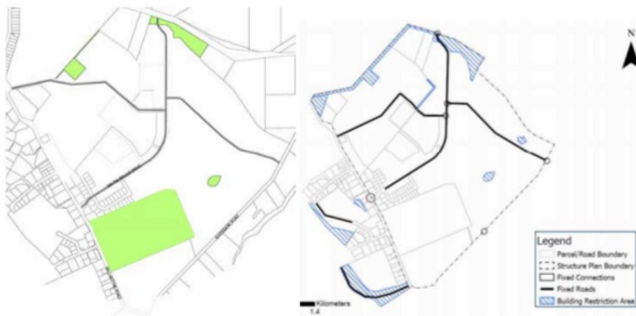
Figure 19: Structure Plan comparison (Fixed Roads)

11. In terms of the Willowridge request to realign the ‘western fixed road’ as shown below (paragraphs 109-112 Ms Costello’s evidence), I rely on Councils’ traffic evidence which raises concerns regarding the feasibility of a roundabout in this location and remain of the view that the location of the new intersection is not supported by the current evidence.