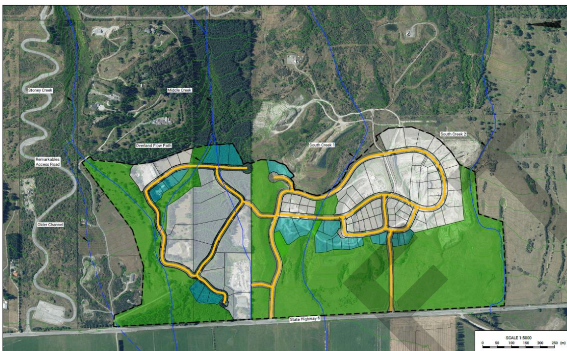
Figure 1: Proposed Coneburn Industrial Zone site plan (Figure 1a in Geosolve report July 2021).

As part of the review we have been provided with the following technical documents: