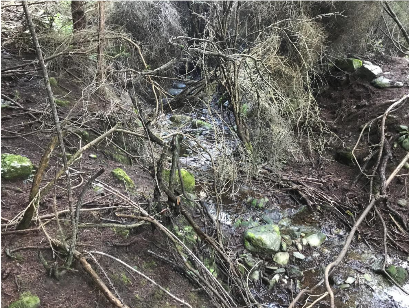
Photograph 4: Middle Creek channel. RL ~430 above the site. Showing limited coarse material from debris flood deposition in the depositional zone.